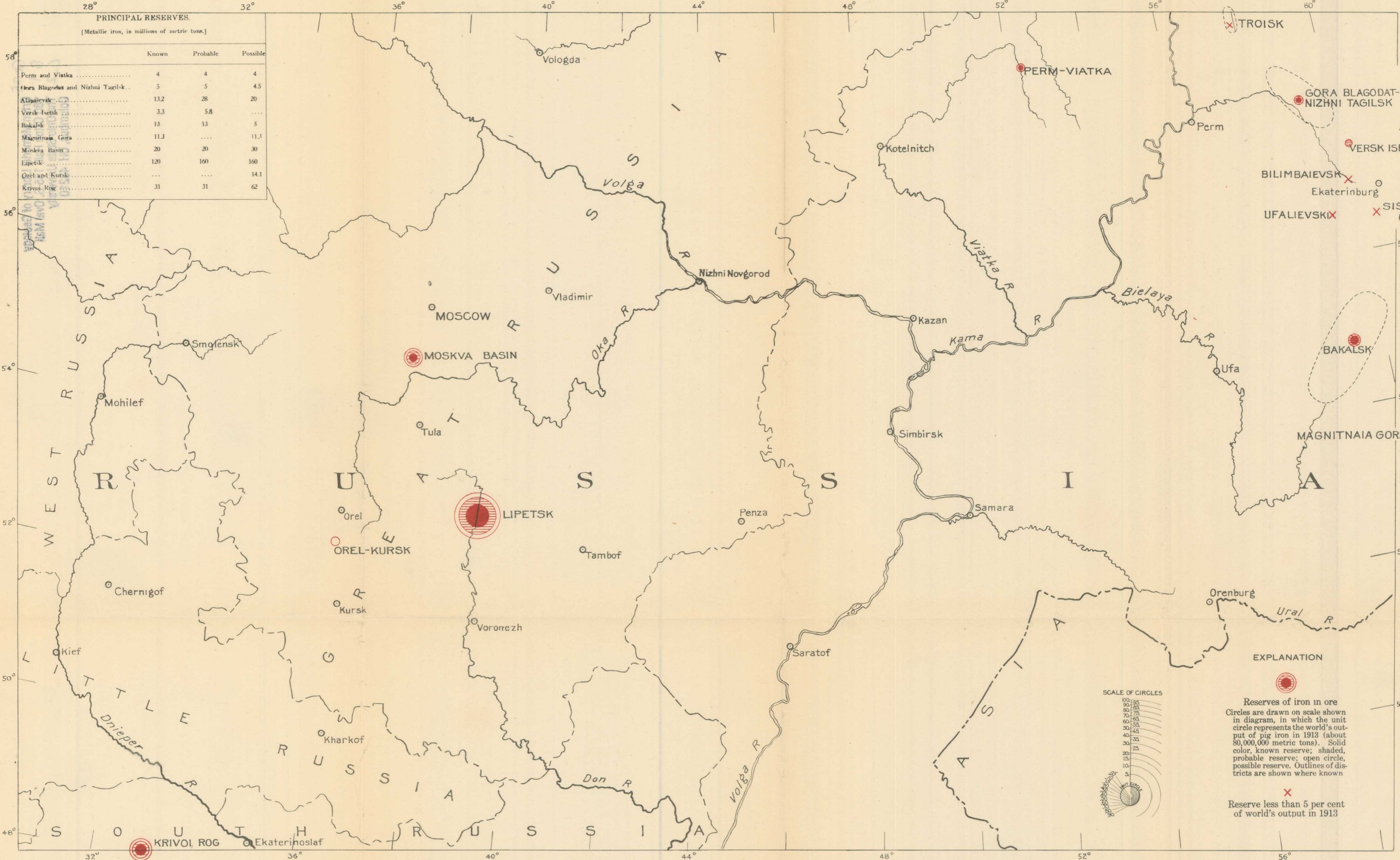
OUTLINE MAP OF CENTRAL RUSSIA, SHOWING RESERVES OF IRON IN ORE

Scale = 5,000,000 0 50 100 150 MILES 1921