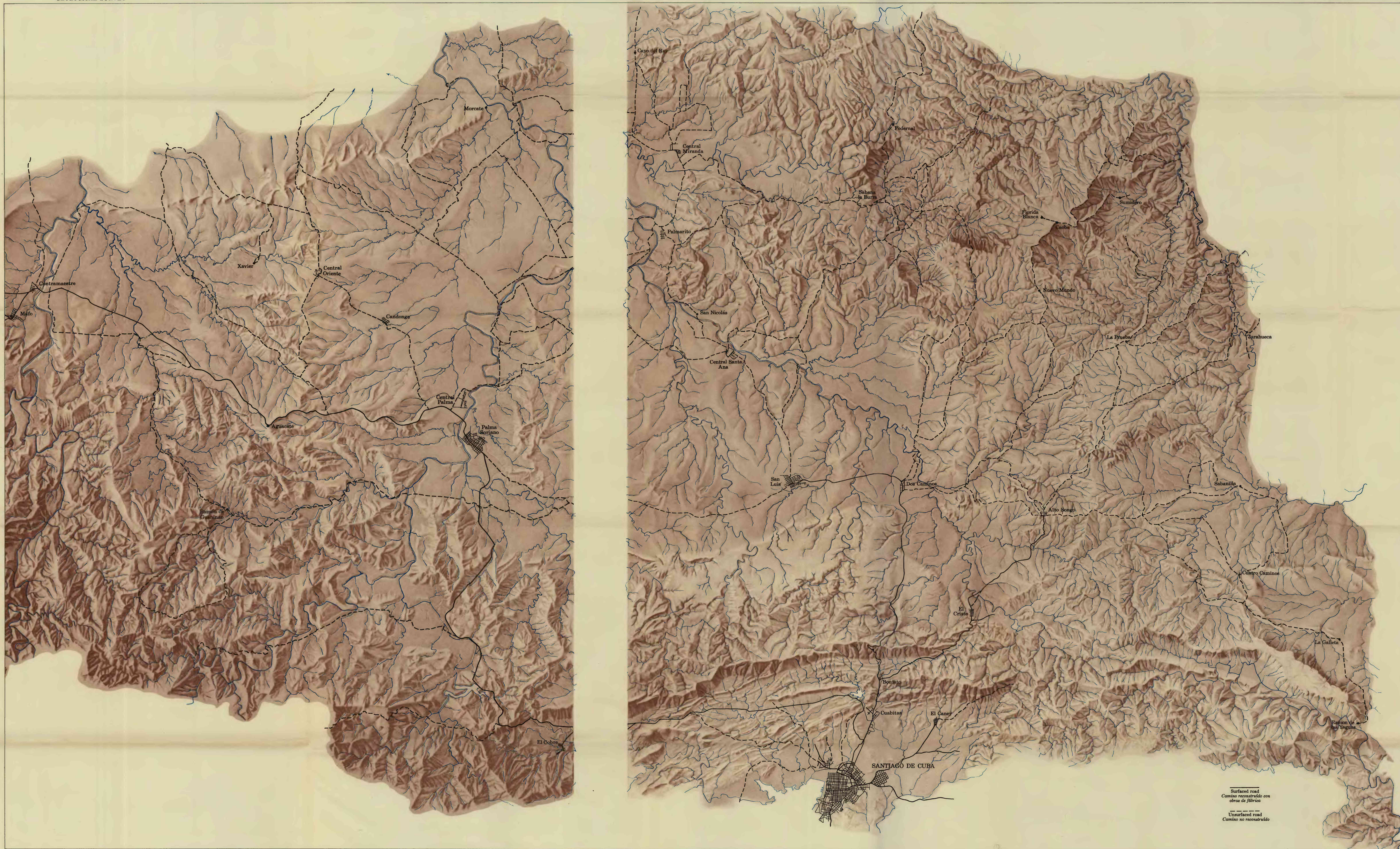
RELIEF MAP OF SOUTH-CENTRAL ORIENTE, CUBA MAPA DE RELIEVE DE LA PARTE SUD-CENTRAL DE ORIENTE, CUBA