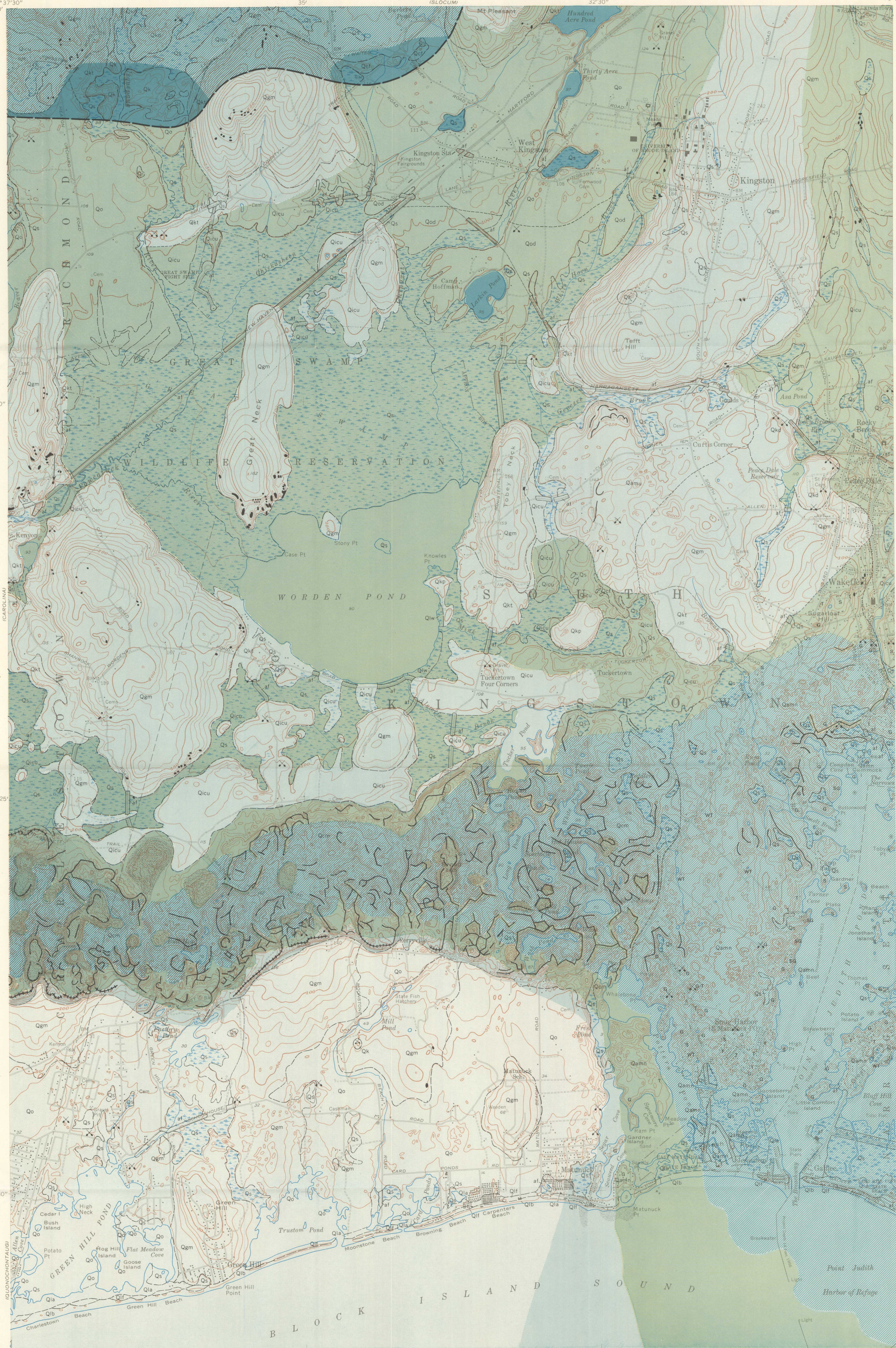
PATTERN OF ICE WASTAGE IN FIVE ARBITRARILY SELECTED INTERVALS KINGSTON QUADRANGLE, RHODE ISLAND