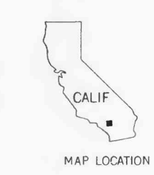
MAP SHOWING GEOCHEMICAL SAMPLE LOCALITIES IN SHEEP MOUNTAIN WILDERNESS STUDY AREA AND CUCAMONGA WILDERNESS AND ADDITIONS LOS ANGELES AND SAN BERNARDINO COUNTIES, CALIFORNIA