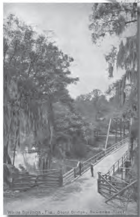
Back Cover: Image of old steel bridge at White Springs in the early 20th century (image courtesy of the Florida State Archive).