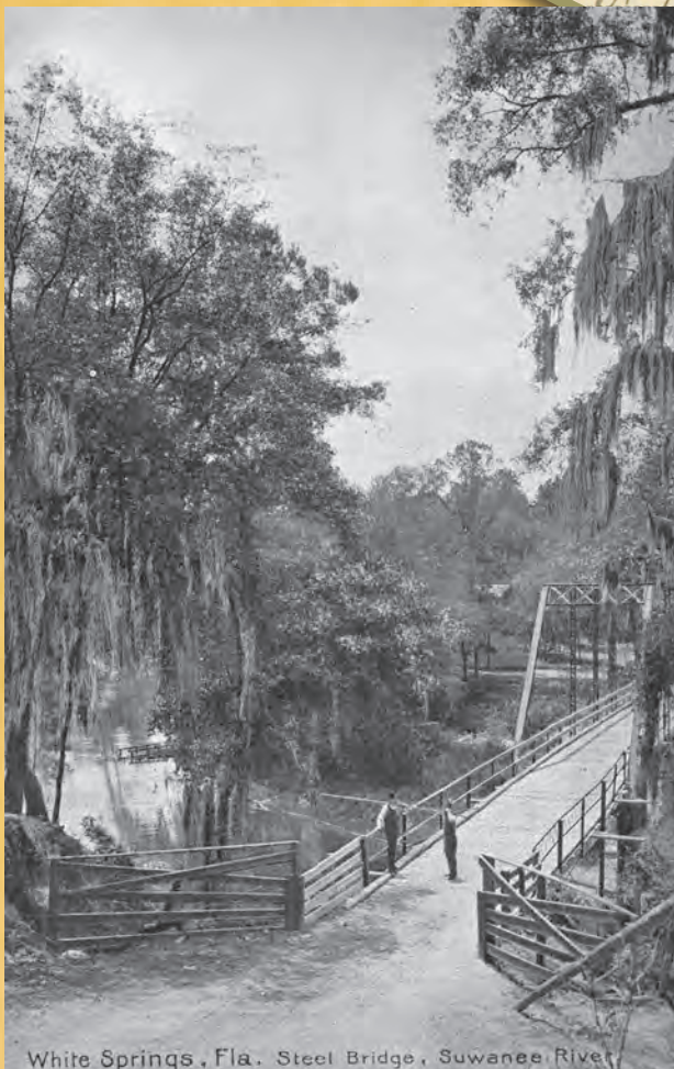
White Springs, Fla. Steel Bridge, Suwannee River