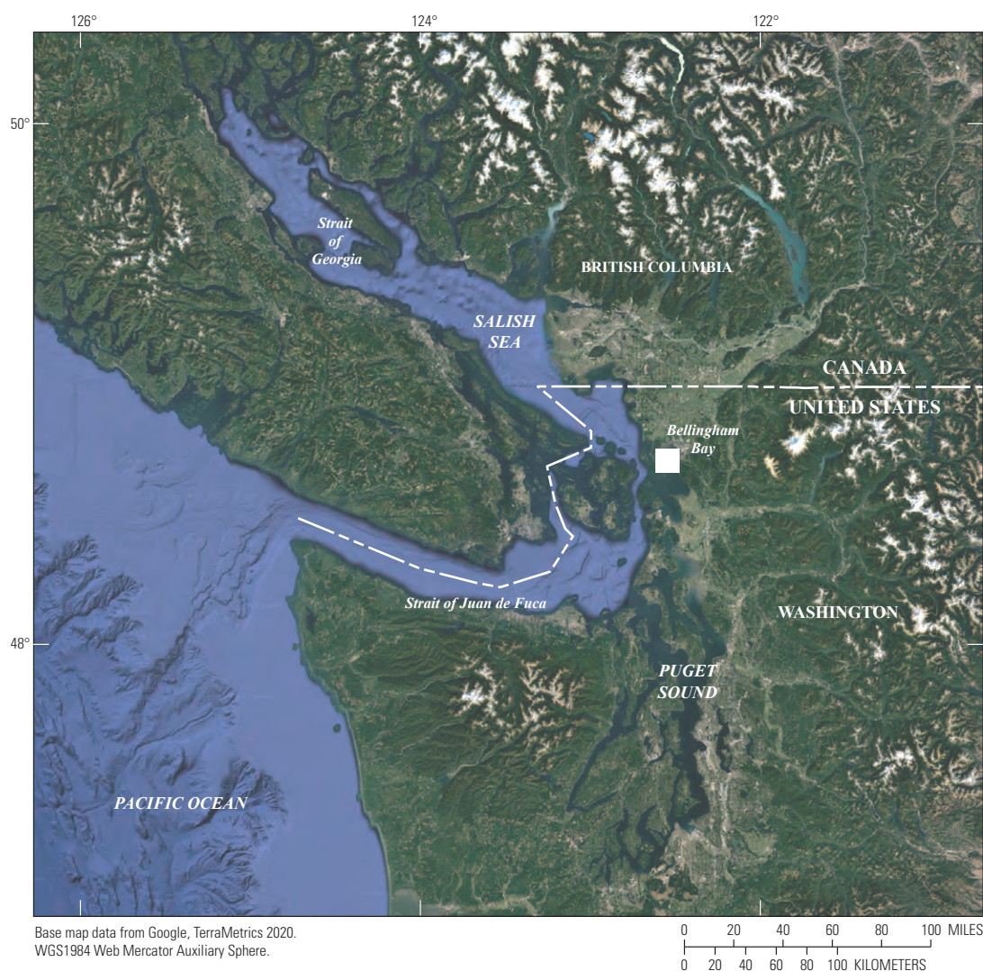
Figure 1. Location of the study area in Bellingham Bay, Washington.

J' is constrained between 0 and 1 and lower values represent a less even distribution of species (for example, when one or several species dominate the catch.).