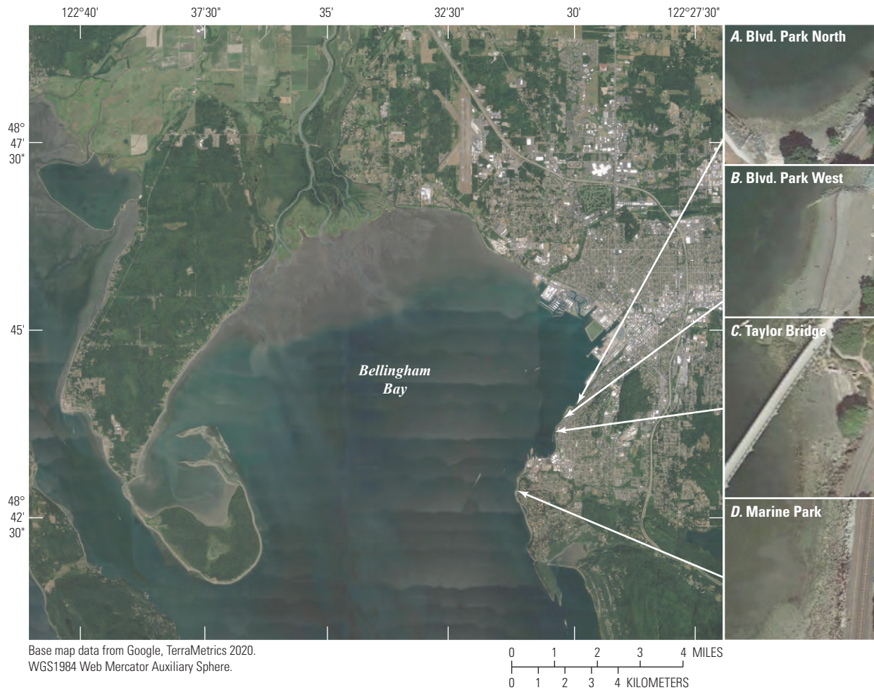
Figure 2. The four eelgrass beach-seining locations in Bellingham Bay, Washington. All four sites were south of Bellingham's urban center and included Boulevard Park North, Boulevard Park West, Taylor Bridge, and Marine Park. Imagery by Landsat for Marine Park on August 8, 2011, and all other sites on July 7, 2018.