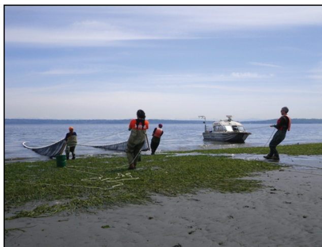
Figure 3. Beach seine being pulled onto shore by personnel in Puget Sound, Washington. Photograph by Dave Ayers, U.S. Geological Survey, July 18, 2012.