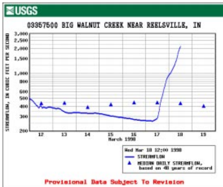
Figure 2. Example of real-time hydrograph from U.S. Geological Survey World Wide Web page.