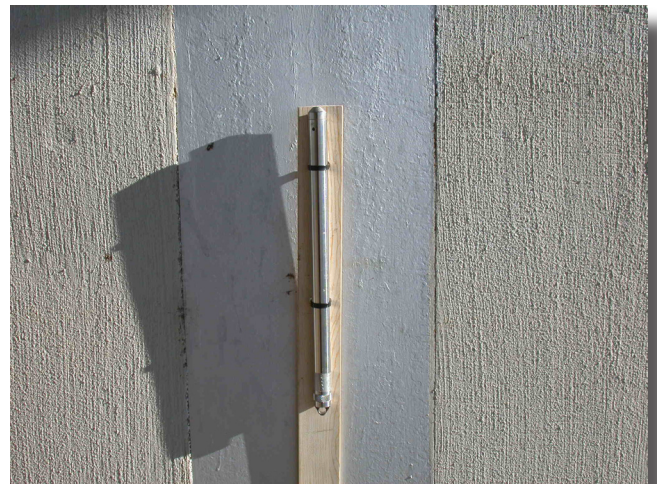
Figure 2. The 2-inch-diameter steel casing of a traditional crest-stage gage in which a transducer is installed. The gage is attached to a wooden lath and secured with nylon ties.

An ACSG is a self-contained data-logging pressure transducer. The transducer is installed in a CSG pipe (fig. 2). During a flood, the transducer measures the hydrostatic pressure of the water column from which the peak stage is measured. The data logger records the stage and time of occurrence during the streamflow event as long as the ACSG is installed low enough to record the lower flows.