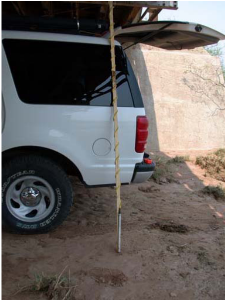
Figure 3. Example of a differential-pressure transducer. Note the cable extended above the transducer on the wooden lath.