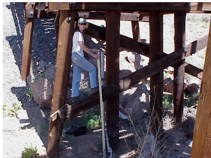
Figure 5. USGS hydrologist attaching an absolute-pressure transducer to a bridge piling at Arroyo Hondo near Santa Fe, N. Mex.