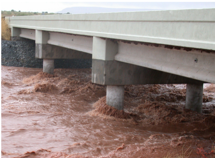
Figure 1. Near peak flow in an ephemeral stream near Variadero, N. Mex. (Garita Creek at Highway 104 Bridge), September 9, 2002.

This fact sheet describes the advantages of using an ACSG. Included is a brief discussion of the differential-(vented) and absolute-pressure transducers that are used for the ACSGs. Selected peak-stage data collected using a CSG cork-line measurement and peak-flow data collected using an ACSG are compared for 12 sites.