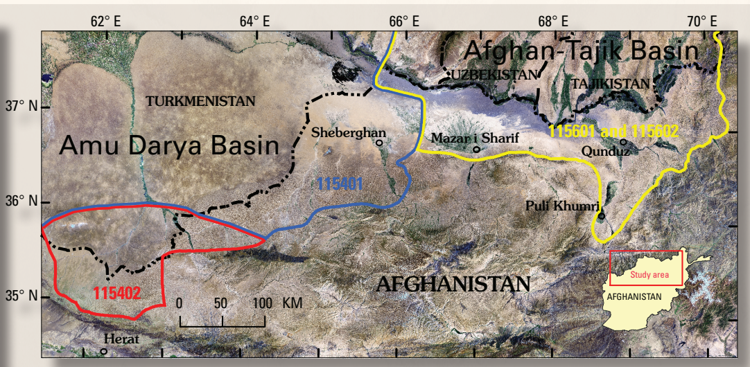
Figure 1. Satellite image of northern Afghanistan showing locations of the Amu Darya and Afghan-Tajik Basins, as well as the Amu Darya Jurassic-Cretaceous Total Petroleum System (115401), Kalaimor-Kaisar Jurassic Total Petroleum System (115601), and Afghan-Tajik Paleogene Total Petroleum System (115602). Some of the total petroleum system boundaries extend west and north beyond the view of the image.