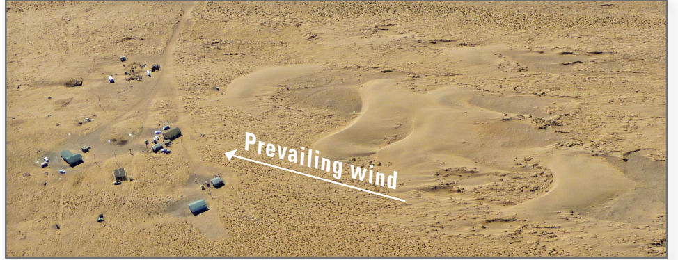
An increasingly dry climate in the U.S. Southwest has led to accelerated migration of active sand dunes and reactivation of previously inactive dunes. In the Native lands of the Colorado Plateau, sand dunes and sand sheets cover one-third of the area. Migration of these dunes can threaten housing and roads, as at this Navajo settlement. Dominant wind direction (arrow) is to the northeast.

The Native Navajo people of the southwestern United States are currently challenged by an increasingly dry climate. Increased aridity from warmer temperatures, combined with recurring drought, has resulted in a large amount of migrating sand that threatens housing, health, and transportation. More than one-third of Native lands on the Colorado Plateau (Navajo Nation and Hopi Tribal Lands) are covered with sand dunes and sand sheets. Such dunes and sand sheets are common features of arid and semiarid environments across the globe, where specific conditions of abundant sand supply, wind, and minimum vegetation cover promote their occurrence. Existing dunes can be grouped into three climatic threshold classes (Lancaster, 1988): immobile (fully