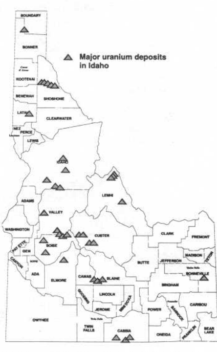
Figure 2. Major uranium deposits in Idaho.

Cecil, L.D., and Gesell, T.F., 1992, Sampling and analysis for radon-222 dissolved in ground water and surface water: Environmental Monitoring and Assessment, v. 20, p. 55–66.