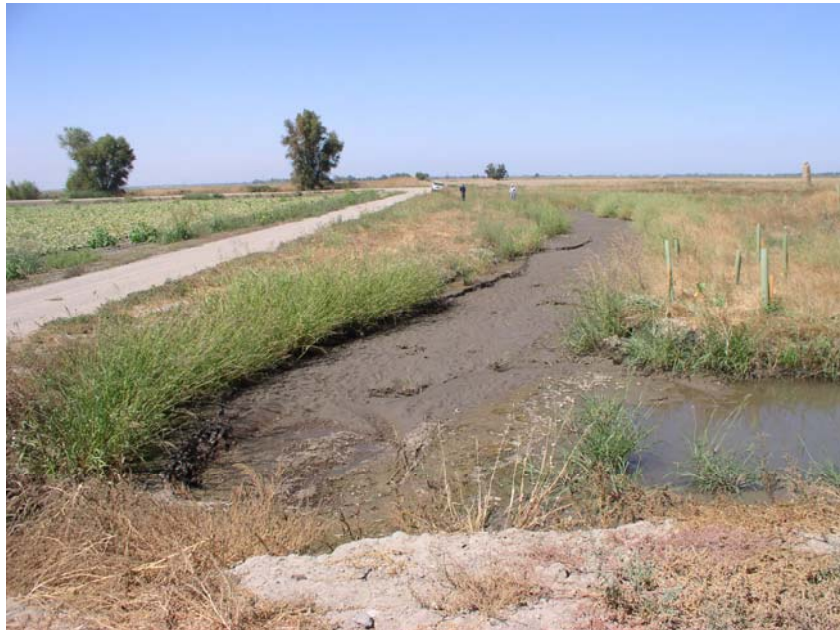
Figure 2 Sediment accumulated in trap.

Near the end of the second growing season after the pond was installed, the landowner reported that there was a danger that the sediment trap would overflow. The trap did not overflow, but by the end of the season the tailwater was running in rivulets over the top of an accumulated mass of sediment. Figure 2 is a photo of the trap at the end of the growing season. The bulk of the sediment came from a tomato field that drained into the downstream arm of the trap. Erosion was evident in the tailwater ditch at the end of this field and in the ends of the furrows where head cutting had occurred. Winter wheat had been grown in this field the previous year, and there had been no evidence of erosion in the field or of sediment accumulation in the trap.