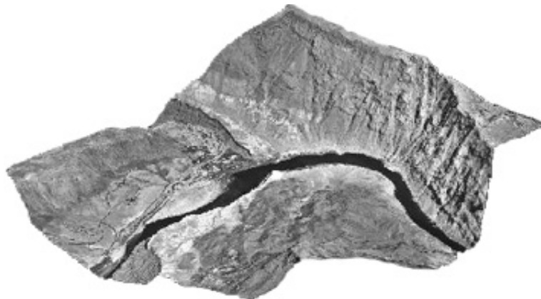
Figure 2. 3-D terrain relief depiction of Glen Canyon.