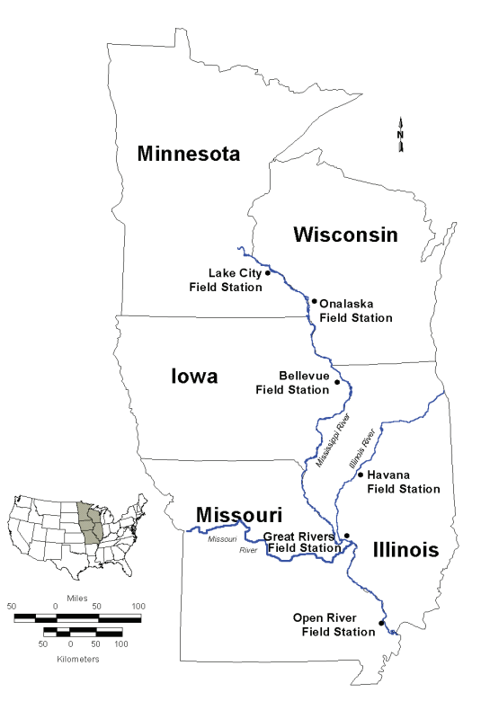
Figure. The Upper Mississippi River System and locations of the six Resource Trend Areas monitored by the Long Term Resource Monitoring Program.

Collections from 2002 provided the first opportunity to assess the accuracy of our predictions. We were unable to incorporate additional contemporary data because sampling was curtailed in the northern RTAs in 2003, and curtailed for the full program in 2004. These reductions were budget driven and independent of studied and planned gear reductions implemented in 2002. Thus, data deriving from 2003 and 2004 have questionable value in a prediction validation context for assessing the quantitative effects of 2002 gear reductions. Based on simulations of program data from 1993 to 1999, our investigation in 2001 predicted that a six-gear design would retain 65% of historical annual catch, but with considerable variation among RTAs (Table 1). In 2002, total program catch was more than 2 times greater than predicted from historical data simulations. Three RTAs observed higher than predicted total annual catches (Pools 13 and 26 and La Grange