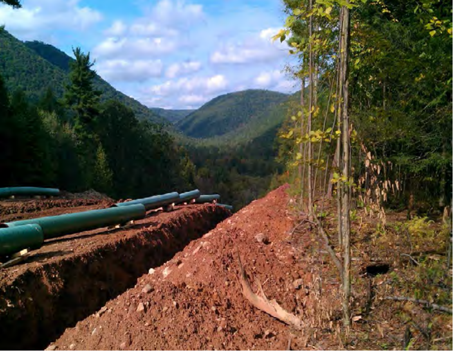
Pipeline construction in the Endless Mountain region near Trout Run, Pennsylvania.