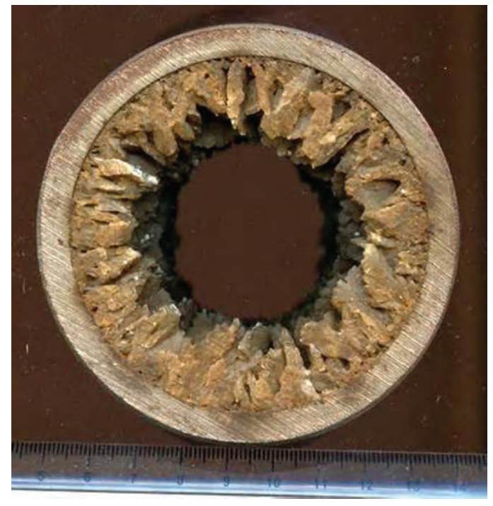
[Scale bar at bottom in centimeters]

The concentrations of NORM present in black shale drill cuttings, drilling mud, scale and sludge build-ups, fluids from spills, treatment residuals, and other waste products may be greater than background environmental levels. Disposal of these waste products on-site or in landfill burial