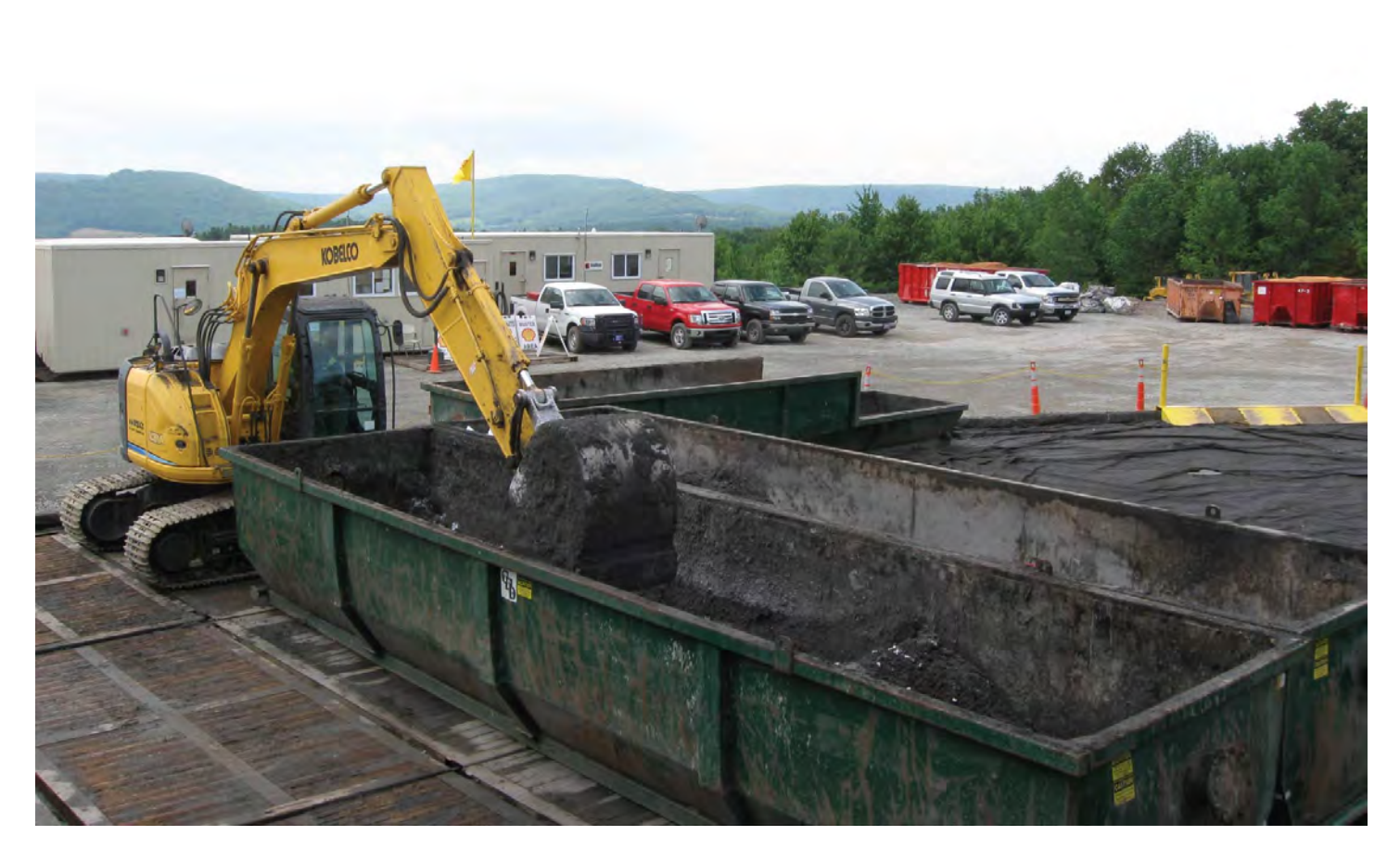
Figure 6. Mixing of drill cuttings with absorbent polymer prior to shipping and disposal in a secured landfill.

The potential for oxidation and leaching of radionuclides and toxic metals associated with organic matter in black shale cuttings led to a preliminary assessment of the geochemistry of a number of black shales by U.S. Department of Energy (DOE) in 2010. The results of this initial study indicate that black shales like the Marcellus Shale contain minor, but detectable, amounts of heavy metals and other elements that can be detrimental to the environment if mobilized and concentrated in the soil or shallow groundwater (Soeder, 2011; Fortson and others, 2011). The results of the Soeder (2011) study were inconclusive but did indicate that additional analyses are needed to better define the fate and transport of leachate from black shale cuttings and evaluate the potential environmental hazards. Additional research by DOE is currently underway (Dan Soeder, DOE, written commun., February 2013).