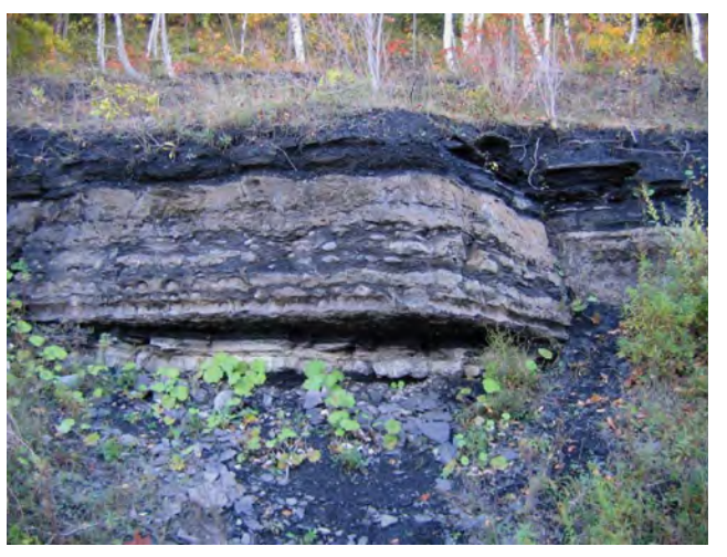
Exposure of the Marcellus shale in central New York showing the Cherry Valley limestone (grey-colored rock) between the Union Springs and Oatka Creek shales of the Marcellus.