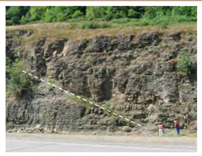
Fault in Upper Devonian bedrock near Towanda, Bradford County, Pennsylvania.