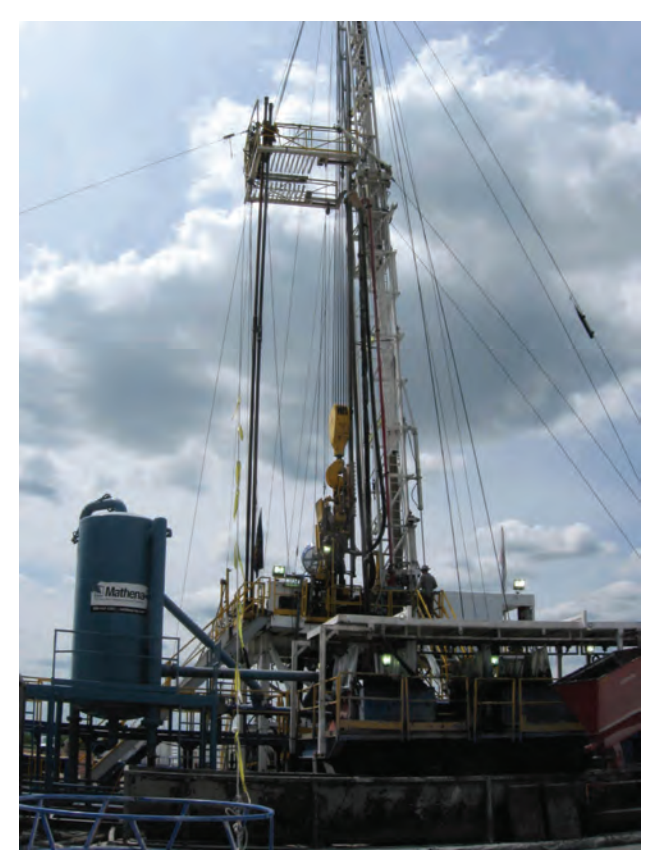
Typical well drilling tower with associated equipment.