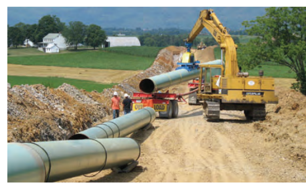
Figure 7. Pipeline construction in northeastern Pennsylvania.

Although the technology for directional or horizontally drilled wells used in combination with sophisticated hydraulic fracturing processes to extract gas resources has improved over the past few decades, the knowledge of how this extraction might affect water resources has not kept pace. Federal and state water-resource and regulatory agencies, the gas industry, and citizens desire a better understanding of the potential environmental effects from the hydraulic fracturing process. Advancements in the science can provide that understanding and lead to the development of best-management strategies for limiting adverse effects of shale gas development in the Appalachian Basin, as well as improvements in monitoring strategies designed to insure environmental quality.