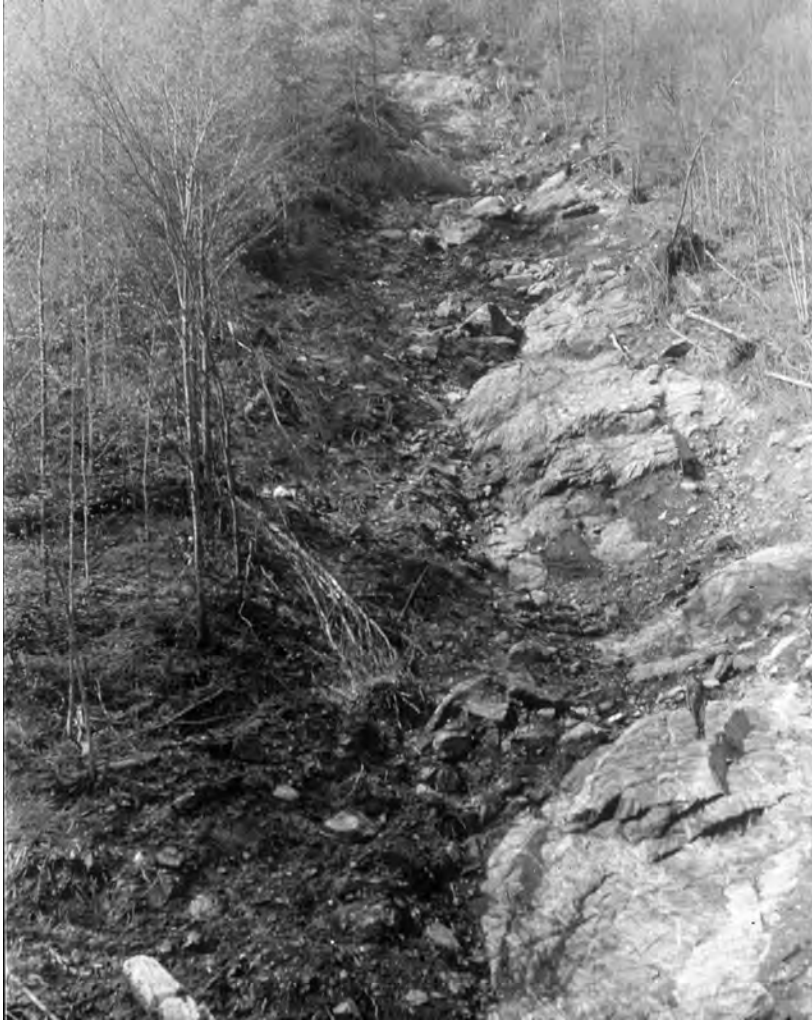
Figure A145. Debris avalanche scar in headwaters of Big Creek, Big Creek near Waynesville, North Carolina, August 1940.