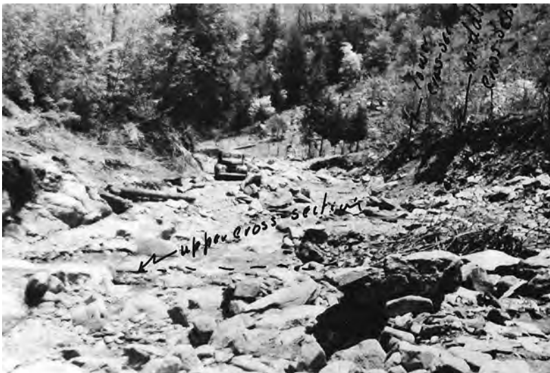
Figure A146. View looking downstream of slope-area reach, Big Creek near Waynesville, North Carolina, August 1940.