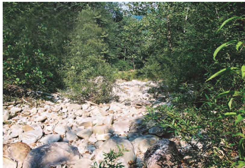
Figure A148. View looking downstream along right bank opposite mouth of Big Creek, likely source of coarse boulders, West Fork Pigeon River near Waynesville, North Carolina, August 25, 2003.