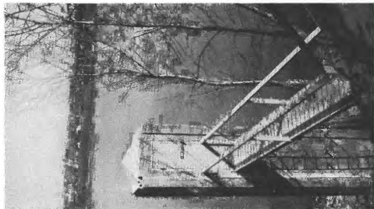
A. ARKANSAS RIVER AT LITTLE ROCK, ARK.