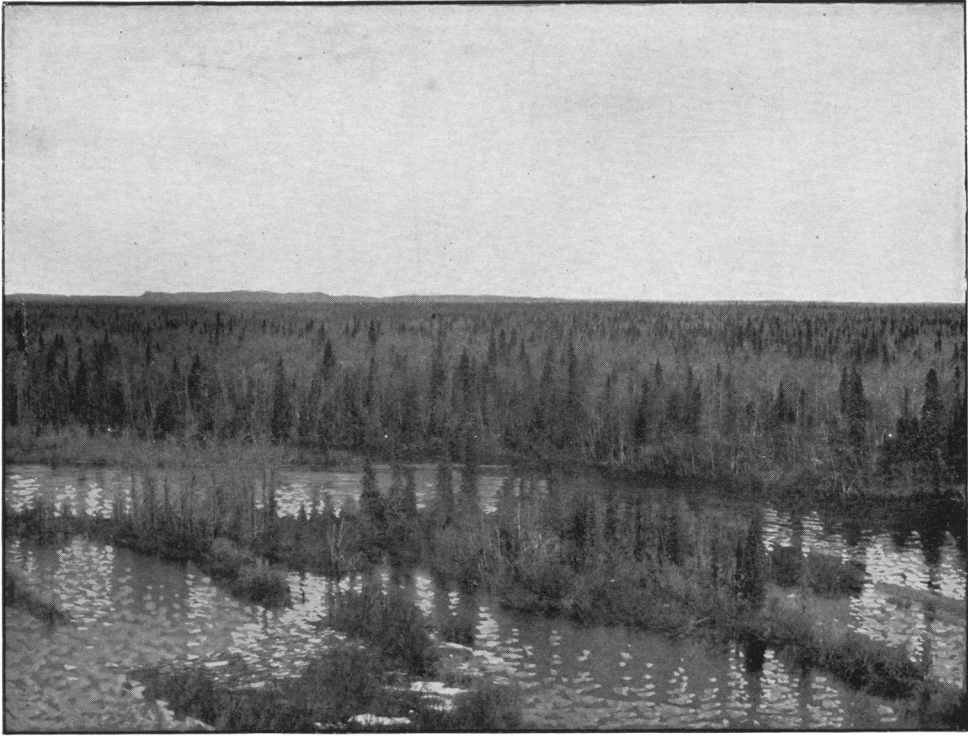
A. SUSHITNA VALLEY, LOWER PORTION.