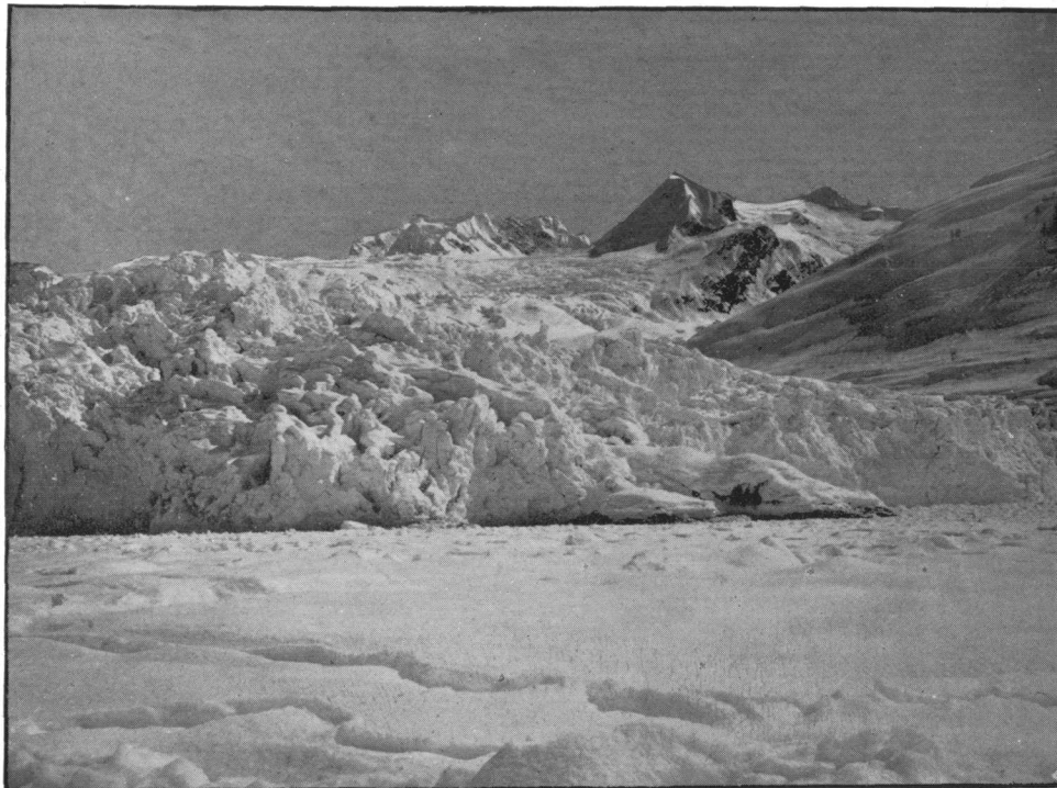
A. EAST GLACIER, AT HEAD OF PORT WELLS.