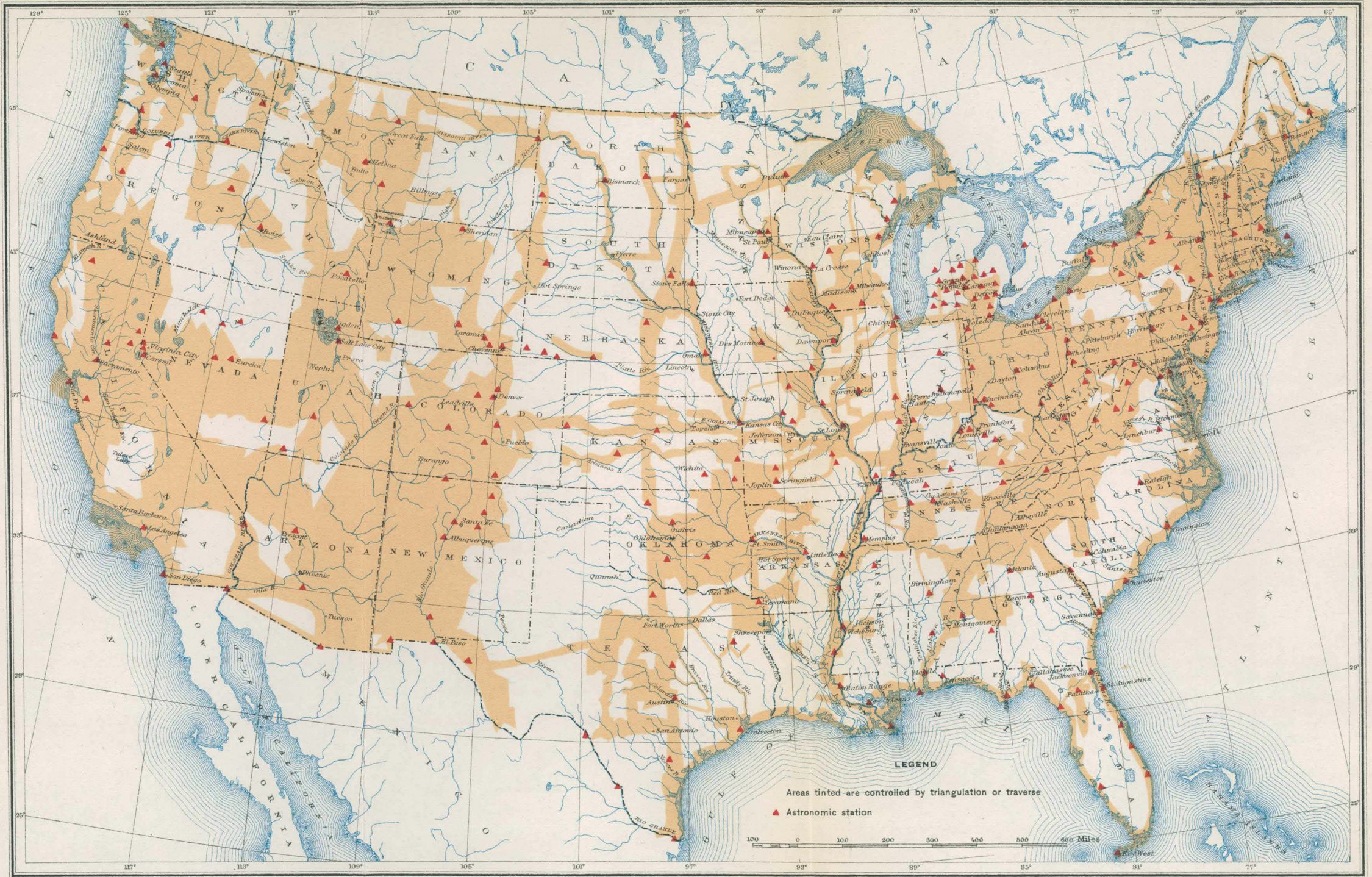
MAP OF THE UNITED STATES SHOWING CONDITION OF ASTRONOMIC LOCATION AND PRIMARY CONTROL to January 1, 1916