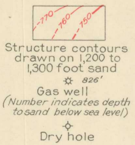
MAP OF THE JENNINGS GAS FIELD, LOWER RIO GRANDE REGION, ZAPATA COUNTY, TEXAS, SHOWING WELLS AND STRUCTURE CONTOURS