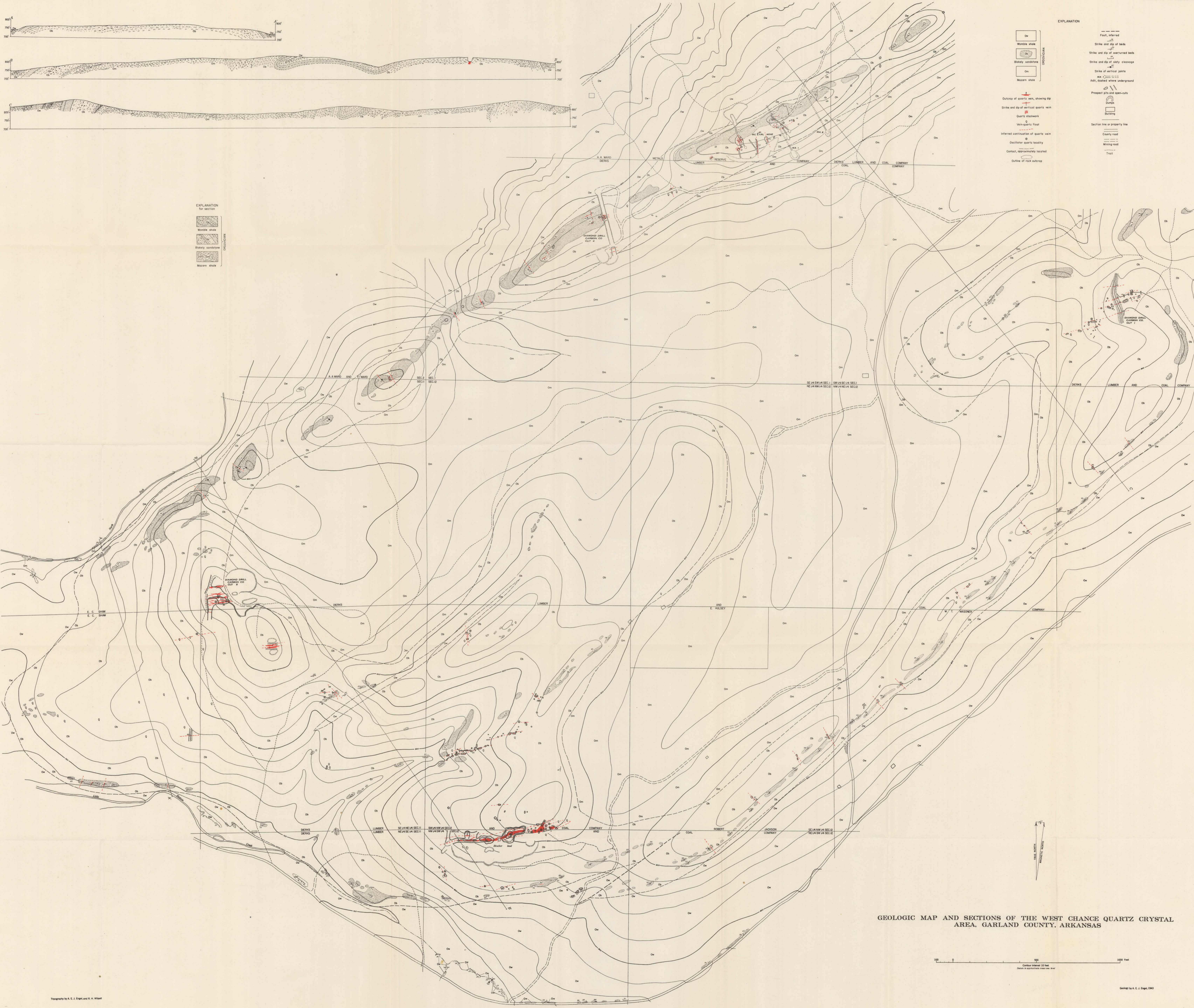
GEOLOGIC MAP AND SECTIONS OF THE WEST CHANCE QUARTZ CRYSTAL AREA, GARLAND COUNTY, ARKANSAS

EXPLANATION Fault, inferred Strike and dip of beds Strike and dip of overturned beds Strike and dip of slaty cleavage Strike of vertical joints Add, dashed where underground Outcrop of quartz vein, showing dip Strike and dip of vertical quartz vein Quartz stockwork Vein-quartz float Inferred continuation of quartz vein Occasional quartz locality Contact, approximately located Outline of rock outcrop Prospect pits and open-cuts Dumps Mining Section line or property line County road Mining road Trail