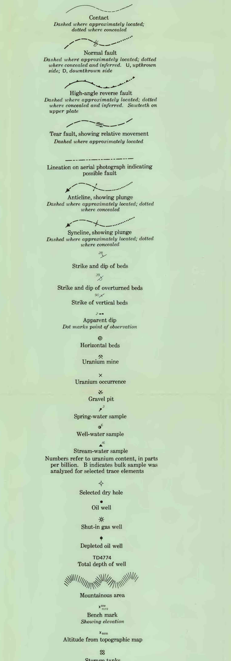
GEOLOGIC MAP OF THE CROOKS GAP AREA, FREMONT COUNTY, WYOMING