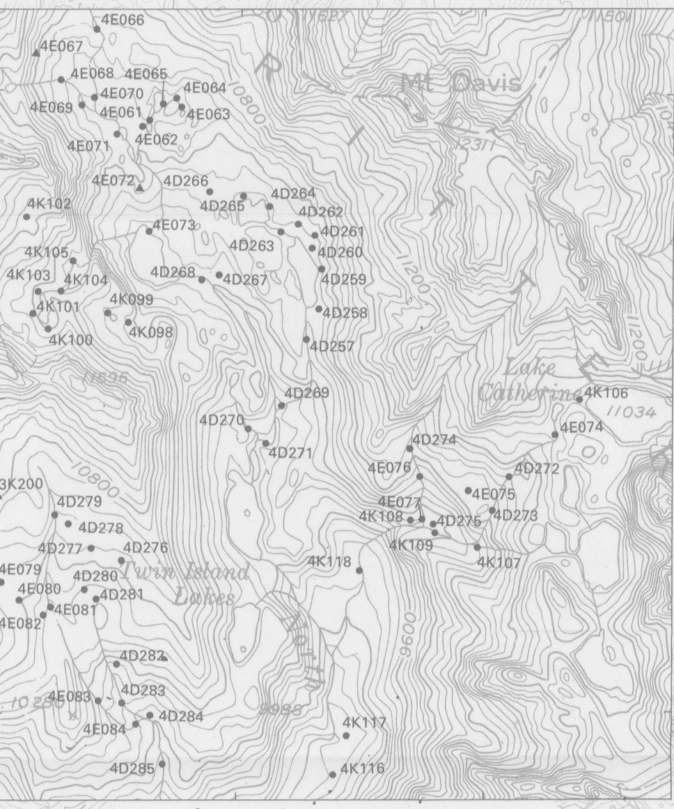
INSET MAP OF UPPER NORTH FORK BASIN AREA

EXPLANATION ● Stream-sediment sample ▲ Rock or mineral sample --- Boundary of Minarets Wilderness --- Boundary of study area