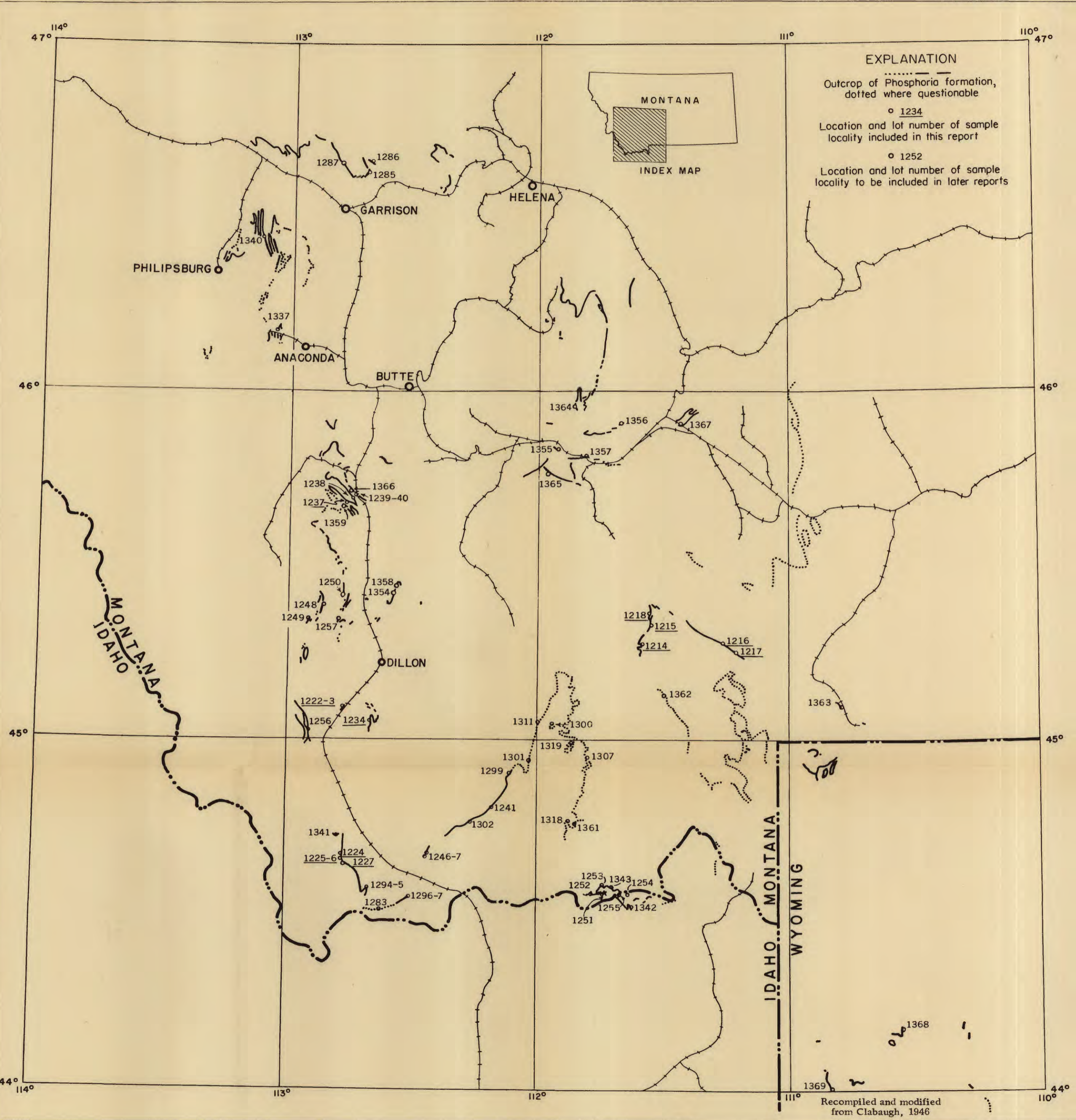
PHOSPHORIA FORMATION OUTCROPS IN MONTANA AND LOCALITIES SAMPLED FOR PHOSPHATE