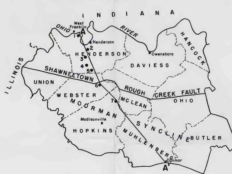
LOCATION OF SECTION

NOTE: OIL TESTS USED FOR CONTROL OF CROSS SECTION