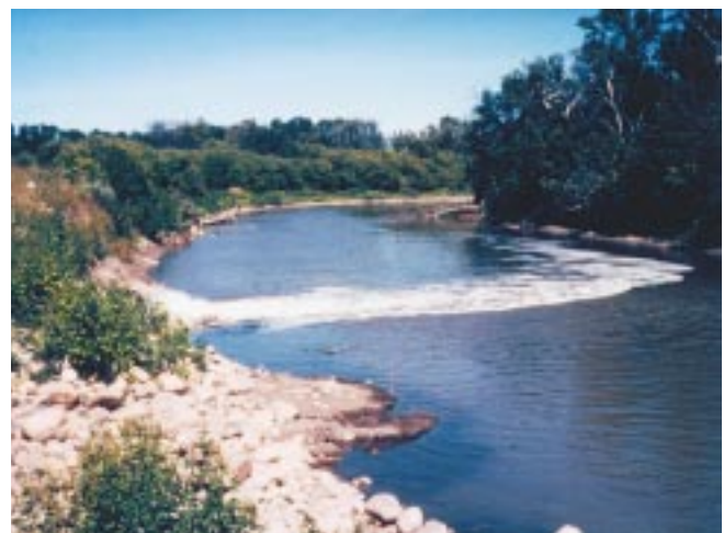
The Fargo municipal outflow pipe discharged into the Red River of the North until September 1995 when a tertiary treatment system was completed.

Although urban areas contribute only a portion of the phosphorus in the Red River (fig. 12), it is a major issue in Red River water quality. Eutrophication due to high concentrations of phosphorus is possible in streams and in Lake Winnipeg, into which the Red River flows (fig. 1). Noxious algal blooms have occurred frequently in Lake Winnipeg (Nielsen and others, 1996). From 1969 to 1974, the Red River contributed about 58 percent of the total phosphorus but only 9 percent of the total flow to Lake Winnipeg (Brunskill and others, 1980). More recently, from 1975 to 1988 the Red River contributed, on average, twice the phosphorus load but only one-fifth the flow of the Winnipeg River (the other major tributary to the southern part of Lake Winnipeg); furthermore, about 60 percent of the phosphorus load at the outflow of the Red River comes from the U.S. portion of the Red River Basin (Brigham and others, 1996).