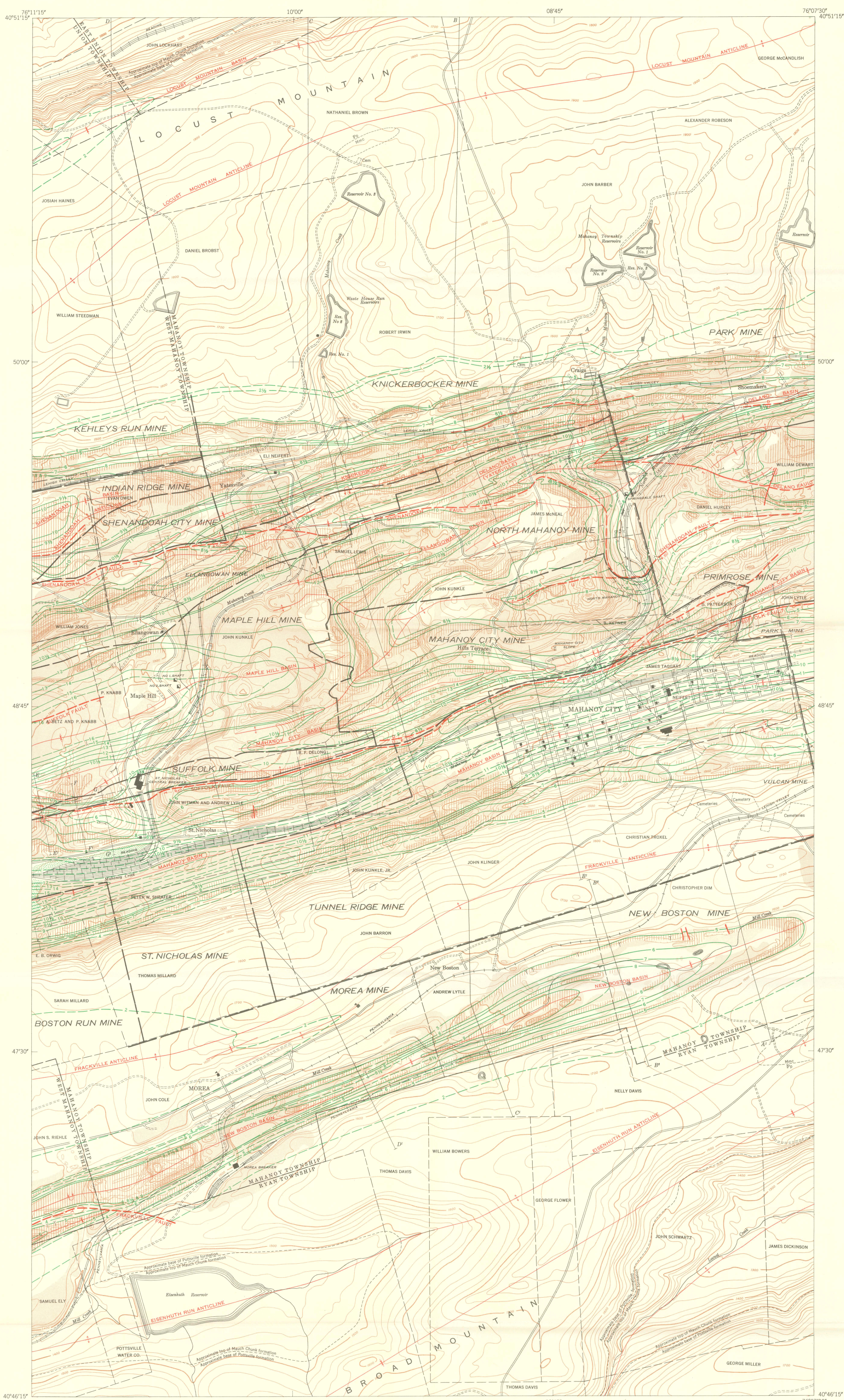
COAL OUTCROP MAP

Base: U.S. Geological Survey topographic map. Polyconic projection, 1927 North American datum. Topography was contoured from aerial photographs made in 1942. Correction has generally not been made for topographic changes resulting from strip mining or alteration of mine refuse banks since 1942.