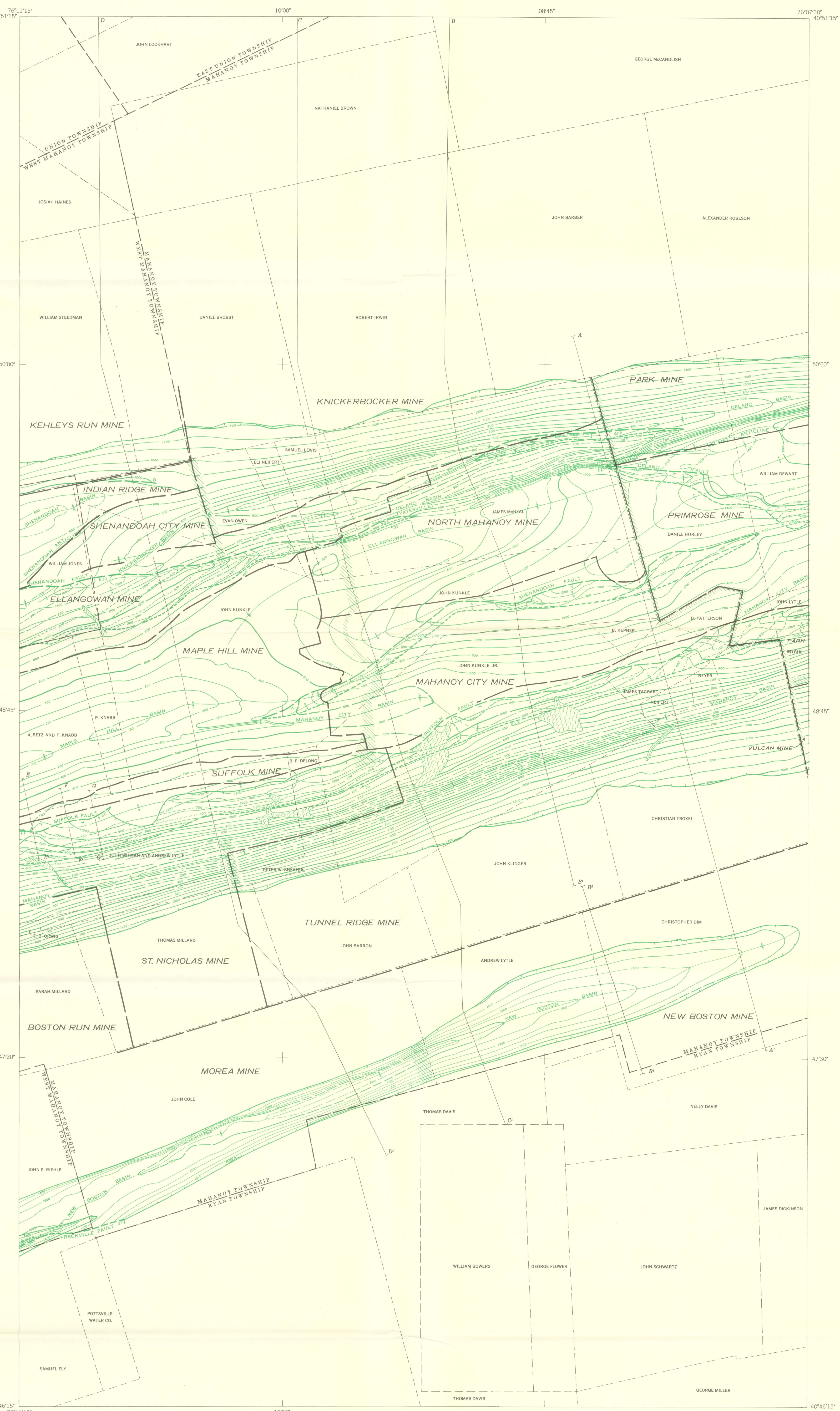
STRUCTURE MAP OF THE BUCK MOUNTAIN COAL BED

Prepared in 1952 from data supplied by the Philadelphia & Reading Coal & Iron Co., the Lehigh Valley Coal Co., and the New Boston Land Co., with modifications by the U.S. Geological Survey.