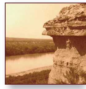
Click here to return to Volume Title Page

Most of the base cartographic data layers used in the GIS project were obtained from the U.S. Department of the Interior National Atlas website, www.nationalatlas.gov, or the U.S. Geological Survey National Map, http://nmviewogc.cr.usgs.gov/viewer.htm.