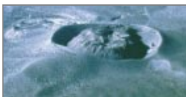
Much of the Long Valley area of eastern California is covered by rocks formed during volcanic eruptions in the past 2 million years. A cataclysmic eruption 760,000 years ago formed Long Valley Caldera and ejected flows of hot glowing ash, which cooled to form the Bishop Tuff. Wind-blown ash from that ancient eruption—which was more than 2,000 times larger than the 1980 eruption of Mt. St. Helens, Washington, that killed 57 people and caused several billion dollars in damage—covered most of the Western United States (inset map). The photo shows a volcanic cone (Panum Dome) formed by eruptions about 600 years ago at the north end of the Mono Craters. The most recent volcanic eruptions in the area occurred in Mono Lake sometime between the mid-1700's and mid-1800's.