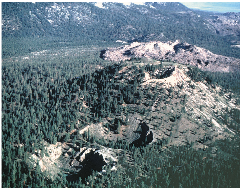
The three Inyo Craters, part of the Mono-Inyo Craters volcanic chain, stretch northward across the floor of Long Valley Caldera, a large volcanic depression in eastern California. During the past 1,000 years there have been at least 12 volcanic eruptions along the chain, including those that formed the Inyo Craters and South Deadman Creek Dome (seen here just beyond the farthest Crater).

Mammoth Mountain, a young volcano on the rim of Long Valley Caldera, was built by numerous eruptions between 220,000 and 50,000 years ago. Volcanoes in the Mono-Inyo Craters volcanic chain, which extends from just south of Mammoth Mountain to the north shore of Mono Lake, have erupted often over the past 40,000 years. During the last 5,000 years, an