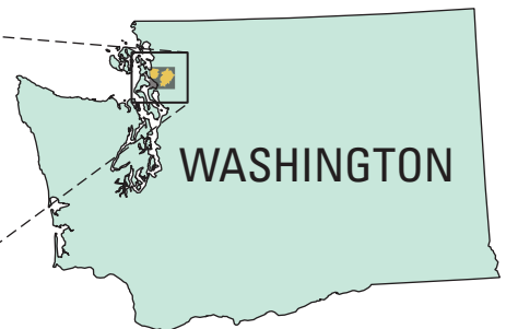
Skagit River Delta and Lower Skagit River tributary subbasins