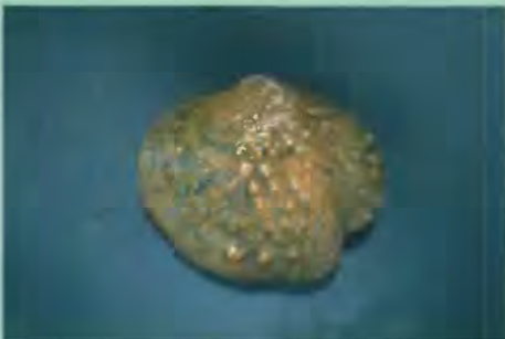
The Lower Tennessee River Basin study unit is known for the prolific distribution of Cumberlandian mollusks. The Muscle Shoals area, near Florence, Alabama, once contained the most diverse assemblage of mussels in the world. Many of these species have been eliminated and several existing species are now endangered or threatened.

Assessing water quality in the lower Tennessee River Basin is important for the protection and efficient use of water and aquatic resources. The Lower Tennessee River Basin NAWQA study will increase scientific understanding of surface- and ground-water quality within the basin and the factors that influence water quality and aquatic resources, such as fish and mussels.