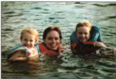
Nine reservoirs in the study unit are used extensively for water recreation.

The main stem of the Tennessee River is highly regulated with few free-flowing stream reaches. Six major reservoirs constructed primarily by the Tennessee Valley Authority from the 1920's through the 1940's for purposes of power generation, navigation, and flood control are located along the lower Tennessee River. Three additional reservoirs are located on major tributaries. Reservoirs along the Tennessee River are also used extensively for drinking water and recreational activities such as fishing, swimming, and boating. Water-resource managers and the public are extremely interested in maintaining the high quality of these reservoirs.