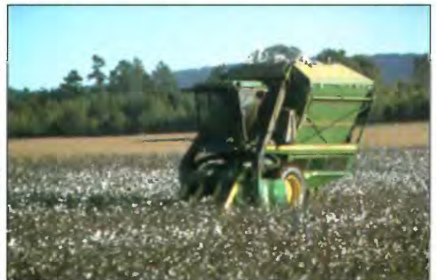
Cotton is a major crop grown in northern Alabama.

The main land use in the study unit is forested land, which covers about 55 percent of the study unit (1992 land cover data from the Tennessee Valley Authority). Additional land uses include row crops and pasture land (41 percent), urban (1 percent), and other land uses (3 percent), such as wetlands, water, and barren land. Row crops occur predominantly along the main stem and small tributaries of the Tennessee River in northern Alabama and along the western edge of the study unit. Cotton, corn, and soybeans are the primary row crops. Confined animal operations are concentrated primarily in northern Alabama.