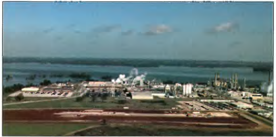
There are numerous industries along the main stem of the Tennessee River in northern Alabama. These industries manufacture and produce a variety of products, such as missiles and rockets, electronics, pulp and paper, synthetic fiber, terephthalic acid, alkalis, chlorine, steering gears, polyester film, refrigerators, aluminum, and nickel-plated foam.

The mean annual discharge at the outlet of the Tennessee River near Paducah, Kentucky, is 65,600 cubic feet per second ( \text{ft}^3/\text{s} ). The mean annual discharge of the Tennessee River at the upstream boundary of the study unit at Chattanooga, Tennessee, is 35,900 \text{ft}^3/\text{s} , thus the lower Tennessee River Basin contributes about 29,700 \text{ft}^3/\text{s} on an annual basis. The two largest basins in the study unit are the Duck River Basin, draining 2,700 \text{mi}^2 , and the Elk River Basin, draining 2,250 \text{mi}^2 . The combined mean annual discharge of the Duck and