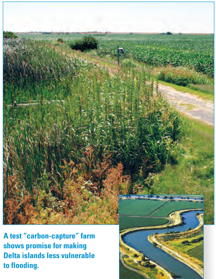
A test "carbon-capture" farm shows promise for making Delta islands less vulnerable to flooding.

The USGS is also developing a pilot project to potentially reverse, or minimize, one of the causes of global warming – the emission of greenhouse gases to the atmosphere. The project might also help save one of California's most-imperiled landscapes – the Sacramento-San Joaquin River Delta. Throughout the Delta, oxidation of the soils from farming practices has