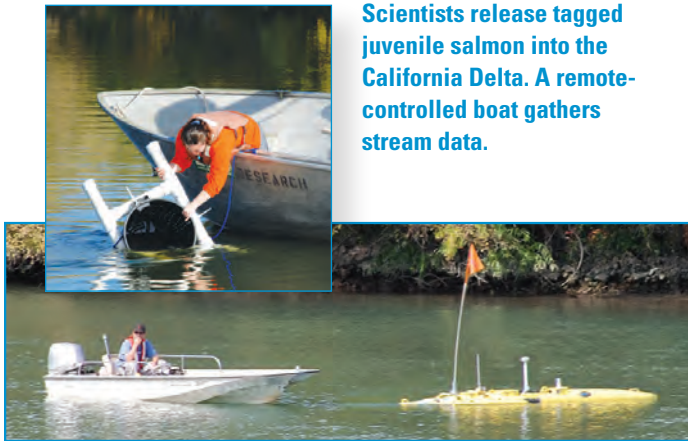
Scientists release tagged juvenile salmon into the California Delta. A remote-controlled boat gathers stream data.

The Sacramento-San Joaquin River Delta is the hub of California's water system and also an imperiled habitat for fish and other wildlife. The USGS California Water Science Center is working with several Federal, State, and local agencies to develop the science for addressing a number of Delta issues. These issues range from fish migration and water flow to pesticides, water quality, and land-surface subsidence. In one of the largest projects, USGS scientists are conducting a high-tech study in cooperation with the California Department of Water Resources to gather data on route selection and survival of juvenile salmon as they make their way through the Delta to the ocean. This research involves many scientific disciplines and the use of emerging technologies in fisheries science and hydrodynamic measurement, including a remote-controlled boat (below) that gathers data on river flows ( http://ca.water.usgs.gov/news/ReleaseNov14_2008.pdf ).