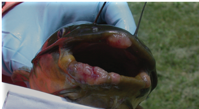
Photograph of a brown bullhead ( Ameiurus nebulosis ) with lip tumors that was collected from the Presque Isle Bay Area of Concern in Erie, Pennsylvania. Bullhead species dwell and feed near bottom sediments; therefore, they are often used as an indicator species of environmental health (Blazer and others, 2014).

Urban development may increase the inputs to streams of complex chemical mixtures typically present in runoff from impervious surfaces in industrial and suburban areas. These mixtures may include pesticides, nutrients, chloride, metals, organic wastewater compounds, and other chemicals that have deleterious biological effects. These effects of toxicity on the biological communities may be defined in terms of