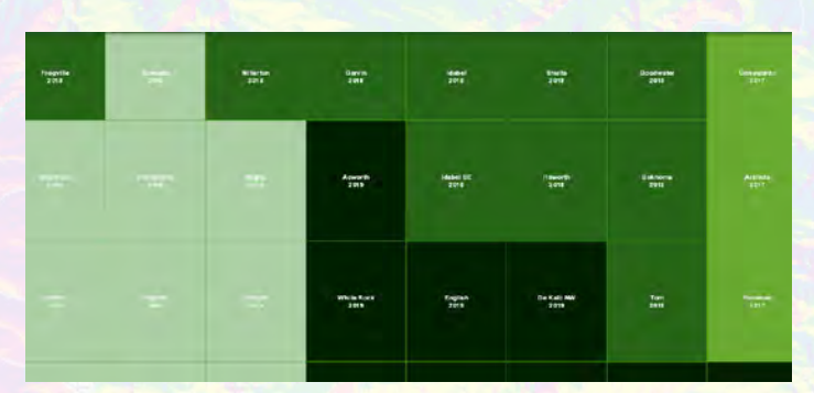
US Topo availability service shows the vintage of the most current map product.