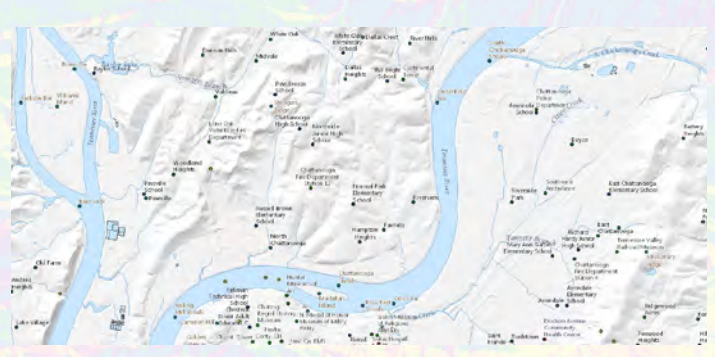
Geographic Names (GNIS)—Official U.S. geographic names service showing physical features, cities and towns, schools, police stations, cemeteries, and more.