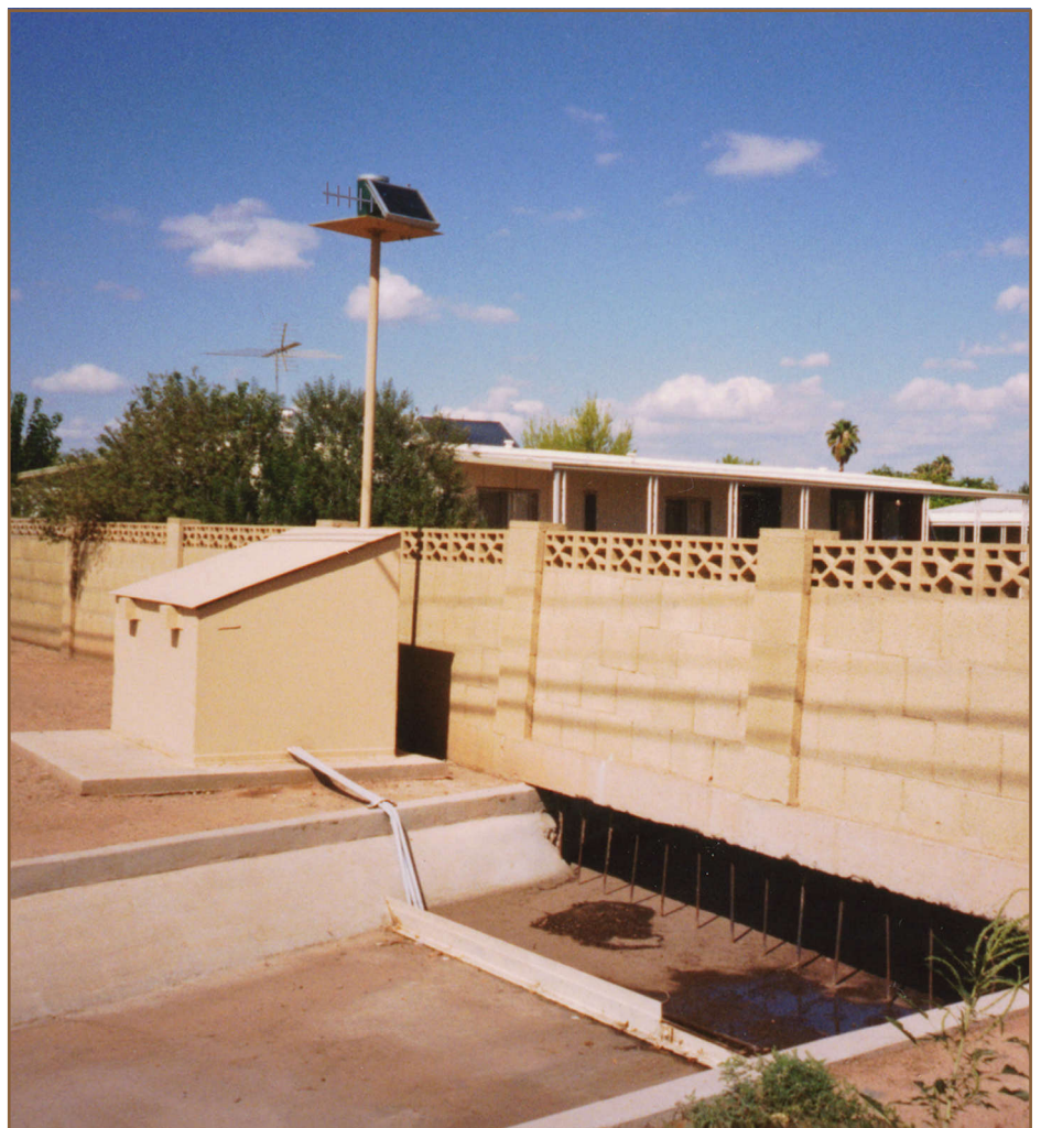
Figure 2. National Pollutant Discharge Elimination System (NPDES) residential land-use site at Glendale, Arizona.

Mean storm loads of dissolved phosphorus varied by more than three orders of magnitude, from 0.0001 to 0.044 pounds per acre. The largest mean storm loads of dissolved phosphorus were associated with industrial land-use basins; the maximum occurred in Baton Rouge, Louisiana.