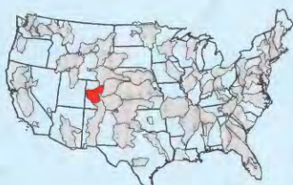
National NAWQA Study Units (shown in gray)