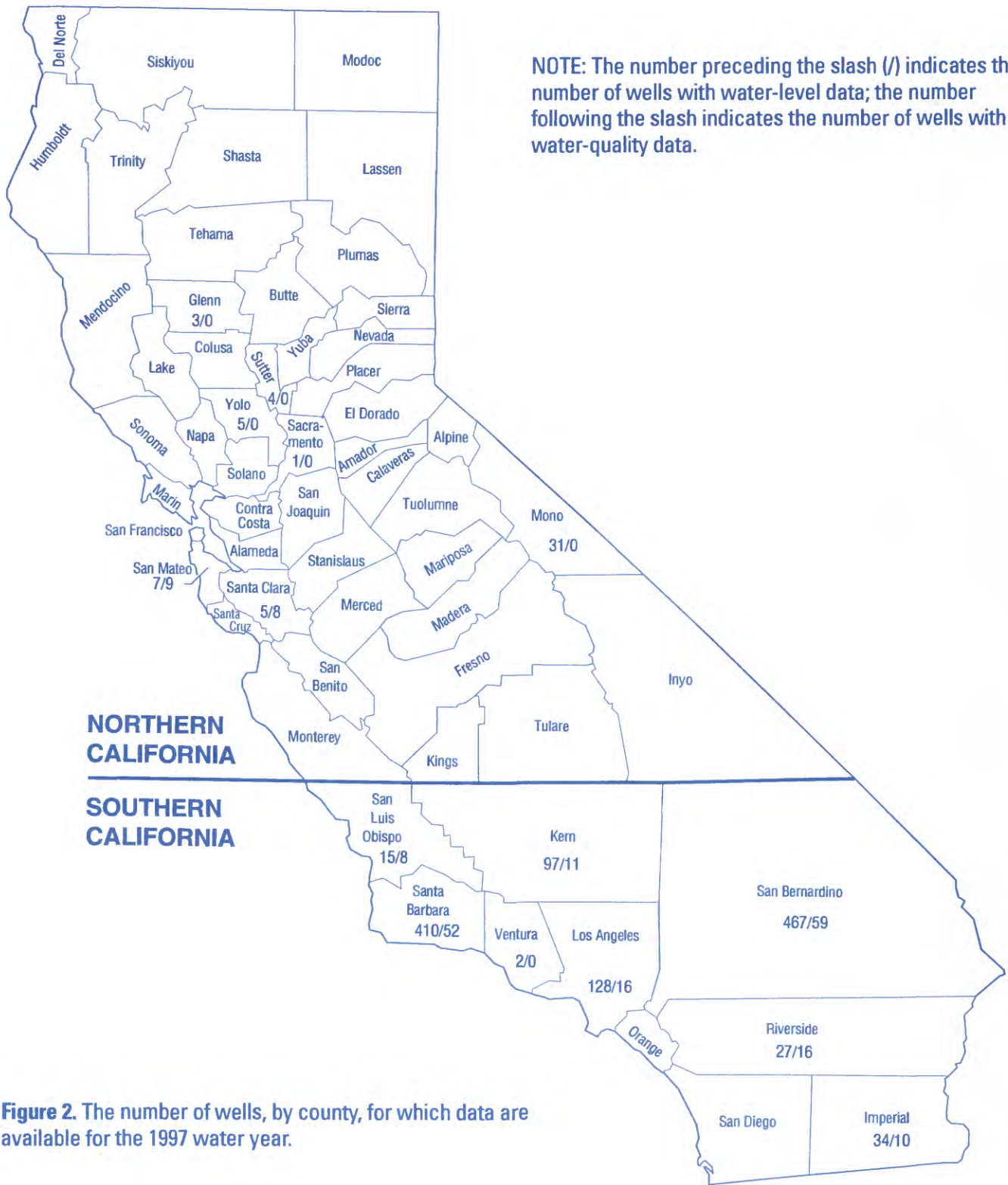
Figure 2. The number of wells, by county, for which data are available for the 1997 water year.