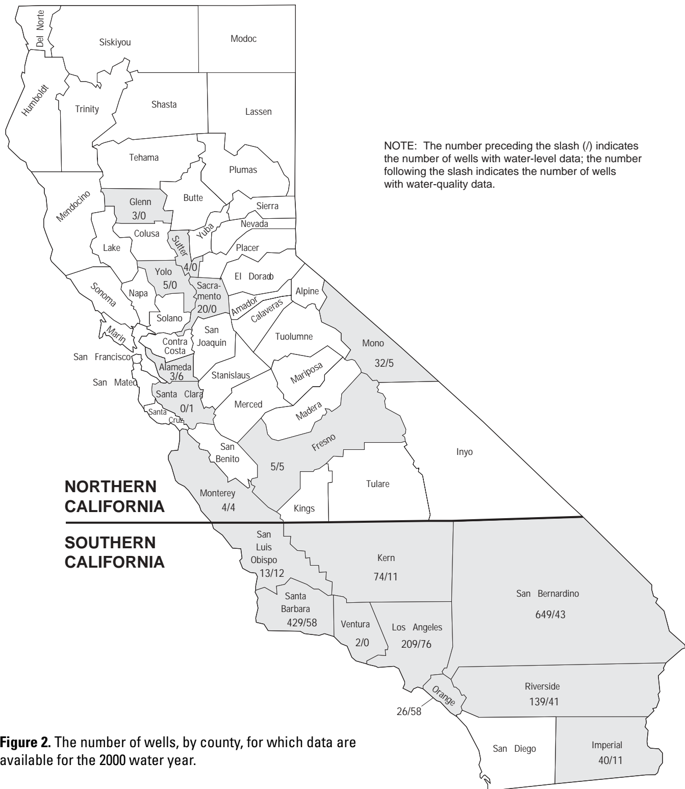
Figure 2. The number of wells, by county, for which data are available for the 2000 water year.