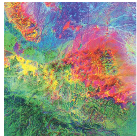
ASTER vniir-swir decorrelation stretch 4(R), 3 (G), 7(B) Saturation stretch.