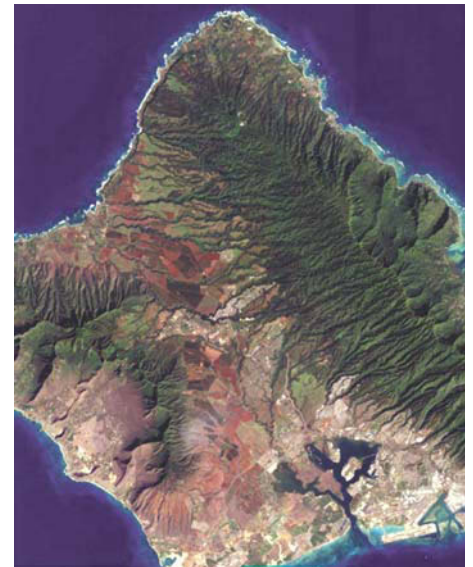
Island of Oahu, Hawaii, imaged by ALI.

For additional information, visit the ask.usgs.gov Web site or the USGS home page at www.usgs.gov .