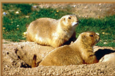
black-tailed prairie dogs Cynomys ludovicianus

Grasslands once dominated central North America, but have undergone radical and rapid changes in the past century. The PRAIRIEMAP project was developed in response to growing concern among scientists and resource managers over significant declines in grassland ecosystems and the wildlife species that depend on them for their survival, also known as obligate species.