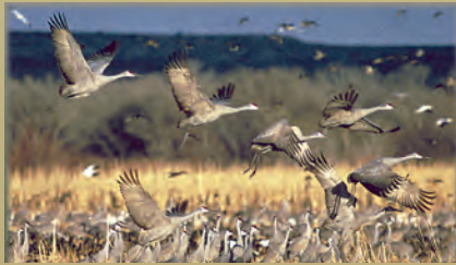
sandhill cranes Grus canadensis

Federal and state land and wildlife agencies currently need spatial data that are readily available and documented to properly address these critical issues in the management of prairie grasslands in western North America. Therefore, the goal of the PRAIRIEMAP project, developed by the USGS Forest and Rangeland Ecosystem Science Center, Snake River Field Station is to collect and maintain spatial data layers and disseminate them on the PRAIRIEMAP website.