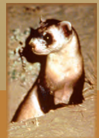
Grassland-obligate species, such as the black-footed ferret ( Mustela nigripes ) have been nearly extirpated due to loss of native grasslands.

As a result of this habitat loss, which has been associated with factors including agricultural development, overgrazing of livestock, oil and gas exploration, and