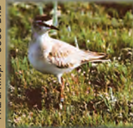
Above: mountain plover Charadrius montanus Right: burrowing owl Athene cucularia