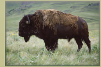
American bison Bison bison