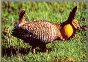
Attwater's prairie chicken

The USGS Forest and Rangeland Ecosystem Science Center, Snake River Field Station (SRFS) maintains a database of spatial information, called PRAIRIEMAP, which is needed to address the management of prairie grasslands in western North America. We identify and collect spatial data for the region encompassing the historical extent of prairie grasslands