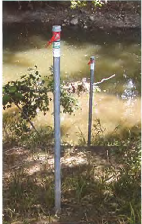
Figure 3. Photo of typical crest-stage gages. All sites have at least two pipes, one upstream and one downstream from the structure (bridge or culvert). Most sites have more pipes to cover the range of stages possible.

At the end of each water year, the peak level that was recorded at each of the sites is determined, and the maximum stage and associated streamflow for the year are published in the USGS annual Water-Data Report for Ohio.