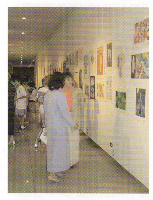
Art Exhibits: Each month, in the main hallway of the National Center, visitors can view a new art exhibit from schools, local artists and photographers, minority groups, and USGS employees.

The National Center is the headquarters of the USGS, which serves as the Nation's premier earth and biological science agency. The USGS works in cooperation with more than 2,000 organizations across the country to provide reliable, impartial scientific information to resource managers, planners, and other customers. This information is used to minimize the loss of life and property from natural disasters; safeguard the nation's natural resources and enhance the quality of life through the careful monitoring of our water, biological, energy, and mineral resources.