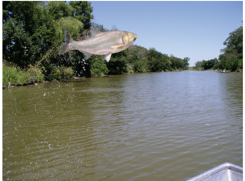
Silver carp have been found in the Upper Mississippi River basin since 1983. They pose danger to boaters and anglers because they respond to boat motor vibrations by leaping several feet out of the water.

Interest is growing in predicting the identity, distribution, and effects of potential aquatic invasive species, and UMESC has capabilities in these areas. For example, we have developed a risk assessment for bighead and silver carp and have completed a major effort with the Bureau of Reclamation to examine the use of taxon-specific chemicals and integrated control of invasive fishes in the Southwest. Also, UMESC scientists will continue to provide leadership by serving on the Asian Carp Working Group of the Aquatic Nuisance Species (ANS) Task Force, Risk Assessment Advisory Panel of the National Invasive Species Council, and the Mississippi River Basin Panel on ANS, as well as to address issues related to other nuisance aquatic invasives such as the snakehead.