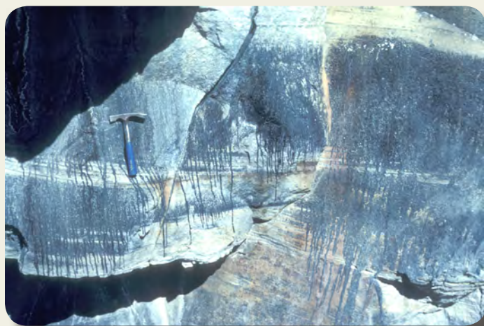
Figure 1. Photograph of an outcrop of cross-stratified fluvial sandstone with natural bitumen (black), Sunnyside accumulation, Carbon County, Utah. Hammer for scale.

The locations of more than 500 accumulations of natural bitumen in the United States were compiled by Ball Associates Ltd. (1965), but resource estimates were provided for only a limited number of the accumulations. The most recent study providing