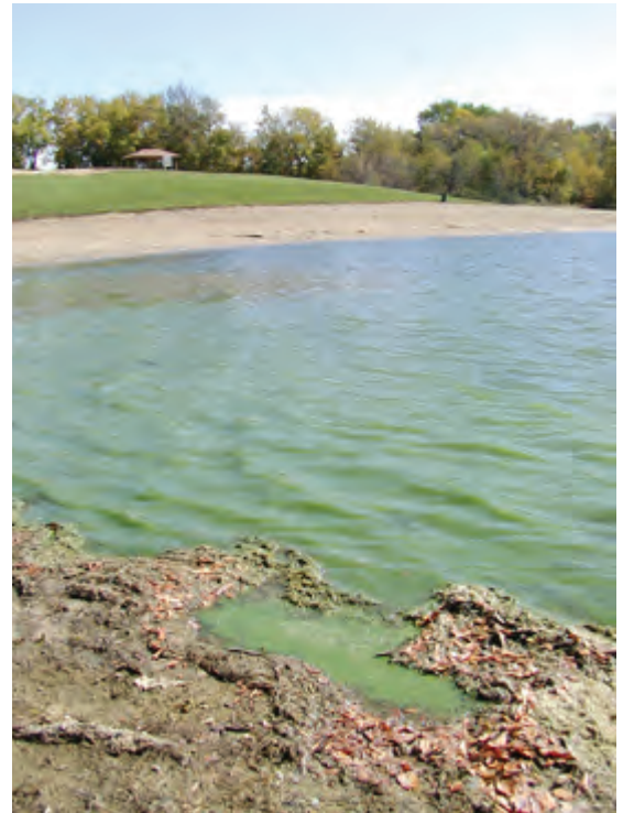
Harmful algal bloom in a Missouri reservoir used for drinking-water supply and recreation, October 2001.

Freshwater and marine harmful algal blooms (HABs) can occur anytime water use is impaired due to excessive accumulations of algae. HAB occurrence is affected by a complex set of physical, chemical, biological, hydrological, and meteorological conditions making it difficult to isolate specific causative environmental factors. Potential impairments include reduction in water quality, accumulation of malodorous scums in beach areas, algal production of toxins potent enough to poison both aquatic and terrestrial organisms, and algal production of taste-and-odor compounds that cause unpalatable drinking water and fish. HABs are a global problem, and toxic freshwater and (or) marine algae have been implicated in human and animal illness and death in over 45 countries worldwide and in at least 27 U.S. States (Yoo and others, 1995; Chorus and Bartram, 1999; Huisman and others, 2005).