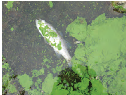
Harmful algal bloom in an Iowa reservoir used for recreation, August 2006.