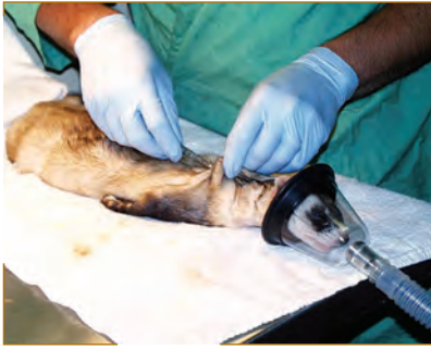
USGS scientist injects a vaccine into a black-footed ferret (NWHC).

Scientists at NWHC have demonstrated in the laboratory that vaccination can protect black-footed ferrets from plague.