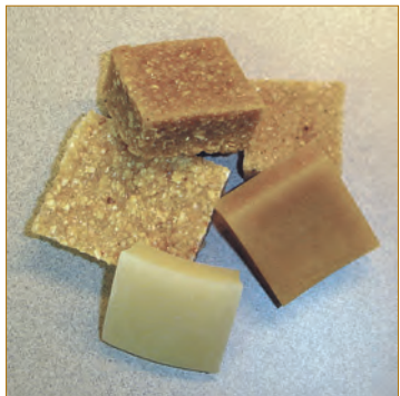
A variety of vaccine-laden oral baits (NWHC).

Laboratory studies have shown that voluntary consumption of this vaccine-laden bait by different prairie dog species results in significant protection against plague infection. Work has now shifted to optimizing baits and distribution methods for field delivery of the vaccine. Peanut butter-flavored baits were shown to be preferred by prairie dogs in laboratory studies, and preliminary field studies using baits without vaccine have shown rates of uptake by wild prairie