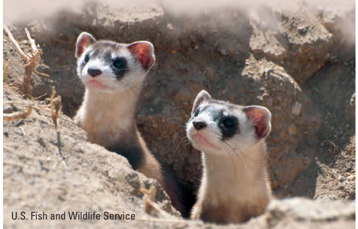
U.S. Fish and Wildlife Service

One of the biggest obstacles to fulfilling this goal is sylvatic plague, a disease highly lethal to both prairie dogs and ferrets. In May 2008, plague was discovered at Conata Basin, South Dakota for the first time, where the largest breeding population of black-footed ferrets resided. Nearly two-thirds of the prairie dogs at Conata Basin died from plague along with about one-third (100) of the ferrets. Efforts to control the outbreak included pesticide application, and trapping and vaccination of ferrets, but these are costly, labor-intensive, short-term solutions. Consequently, continued research into the development of oral vaccines to prevent plague in prairie dogs is needed.