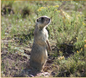
Utah prairie dog (NWHC).

Scientists at the USGS National Wildlife Health Center (NWHC), in collaboration with colleagues at other federal agencies and the University of Wisconsin, are developing and testing vaccines that can be used to protect black-footed ferrets and prairie dogs against plague. The black-footed ferret is commonly regarded as the most endangered mammal in North America, and sylvatic plague is a major impediment to its recovery. The three prairie dog species (Gunnison's, black-tailed, and white-tailed prairie dogs), upon which the ferret depends for food and whose burrows they use for shelter, have been drastically reduced from historical levels, resulting in the near extinction of the ferret. All three species are considered 'at risk' and have been petitioned for listing as 'threatened' or 'endangered' by the U.S. Fish and Wildlife Service (FWS). Additionally, the Utah prairie dog is listed as threatened and the Mexican prairie dog is considered endangered in Mexico. Like the black-footed ferret, all five prairie dog species are highly susceptible to plague and regularly experience outbreaks with devastating losses. Controlling plague outbreaks is a vital concern for ongoing recovery programs and conservation efforts for both prairie dogs and ferrets.