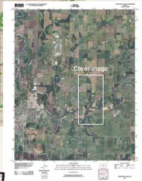
US Topo of Coffeyville East, Kansas (foreground), replaces older map of the same area (background). Data layers generated from US Topo digital files can be viewed on screen and printed.